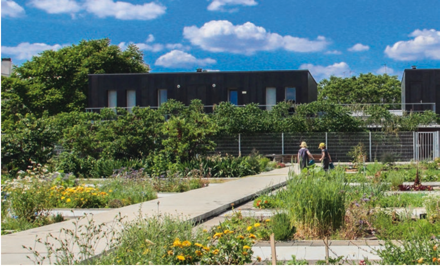
Fig. 10.6 Gymnasium green roof in Paris