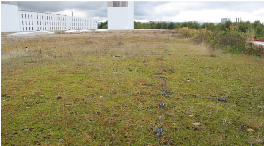
Fig. 10.14 A 4 hectare biodiverse green roof on a shopping mall in Basel

These policies targeted the need to create dry grassland communities at roof level. This approach was embraced in London (see Fig. 10.14) and now provides the basis of the planning approach to extensive green roofs in the UK capital (Greater London Authority 2008).