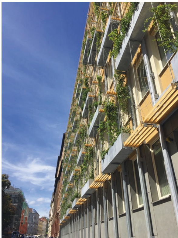
Fig. 10.9 Green wall takes on the function of external shading. Retrofitted building from the 60ies. MA 31 Vienna

The maintenance costs of extensive and semi-intensive green roofs are comparatively low, less than €17/m 2 for green roofs over 1000 m 2 for 40 years of maintenance (Hämmerle and EFB 2007).