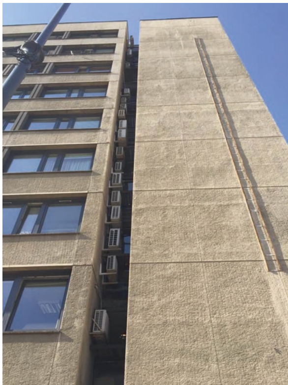
Fig. 10.2 “Cool” facades in Europe’s capitals

through cooling units yet this can be energy inefficient, leading to the release of more greenhouse gases into the atmosphere which in turn intensifies climate change. Furthermore, this does not protect the most vulnerable in our society: the very young or old, the sick and the financially vulnerable who cannot afford air conditioning units for their home. Increasing the supply of air conditioning units is unlikely to lead to sustainable or long-term energy efficiency. Furthermore, with increasing extreme heat events, the current reflective surfaces of cities only add intensity to these events.