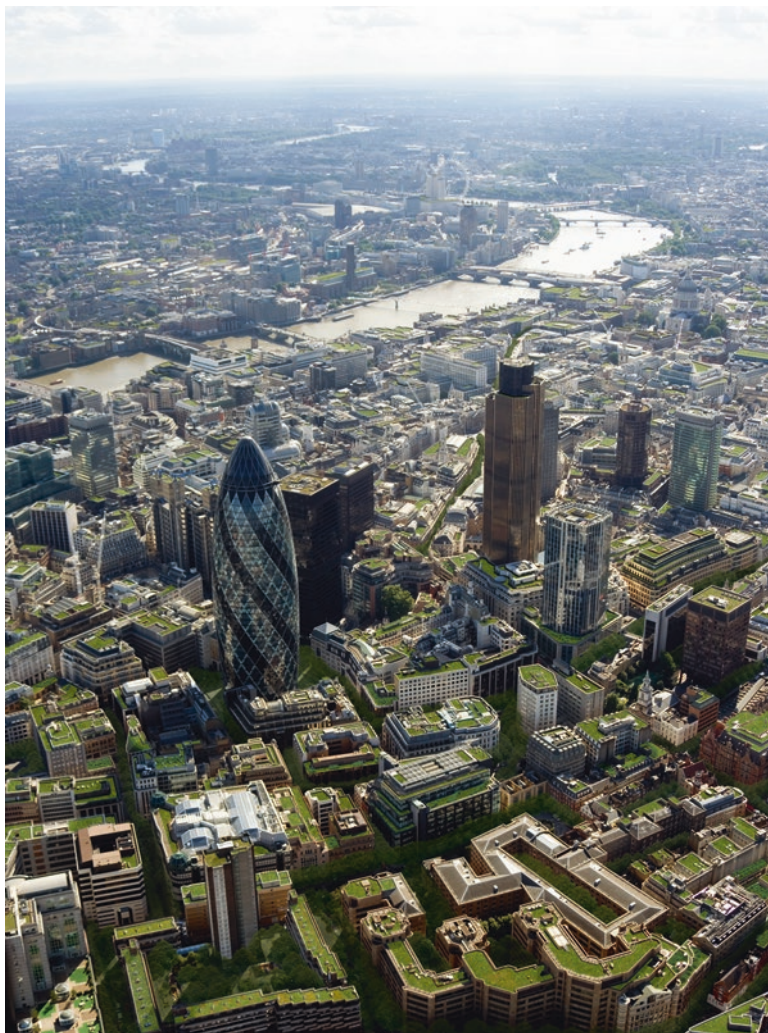
Fig 10.1 Green design for Londons Roofs

Independent market research estimates 2017s vertical greening market at 680 million Euros, a figure equating to the installation of around 1 million m 2 of green walls (Caroles 2015). Further, aside from the capital market, the revenue market associated with building vegetation maintenance is also set to increase, providing long-term, secure and sustainable new jobs.