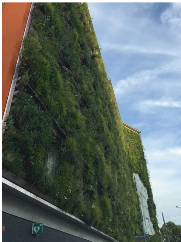
Fig. 10.4 Living wall in Vienna, Municipality Building 48