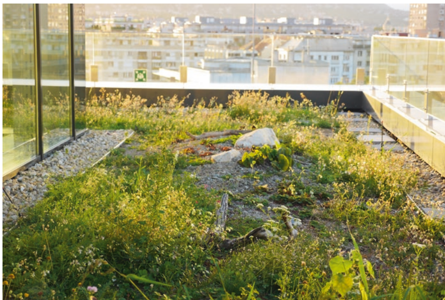
Fig. 10.16 A new and old concept for Biodiversity: LEED Platinum certified “Green House” Budapest, biodiverse hybrid Green Roof 7th floor.

This paper has focused on the microclimate benefits of integrating high quality green infrastructure as part of adapting cities to climate change. It has explained