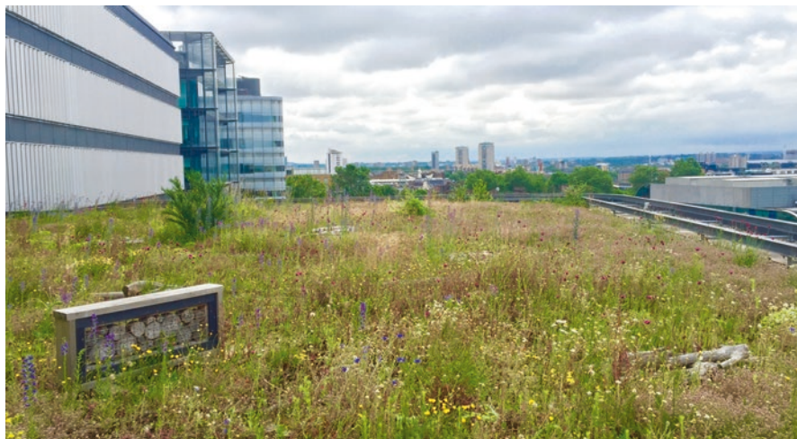
Fig. 10.13 Wildflower roof with insect hotel in London

approaches have been developed to target the replication of ecological circumstances at ground level. This approach was initially started in Switzerland, where policies at local level were developed (Brenneisen et al. 2010).