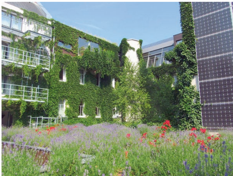
Fig. 10.3 Zero-emission Boutique Hotel Stadthalle, Vienna

also evapo-transpire, they “sweat”. Accumulated moisture is evaporated into the environment, helping to regulate humidity and temperature.