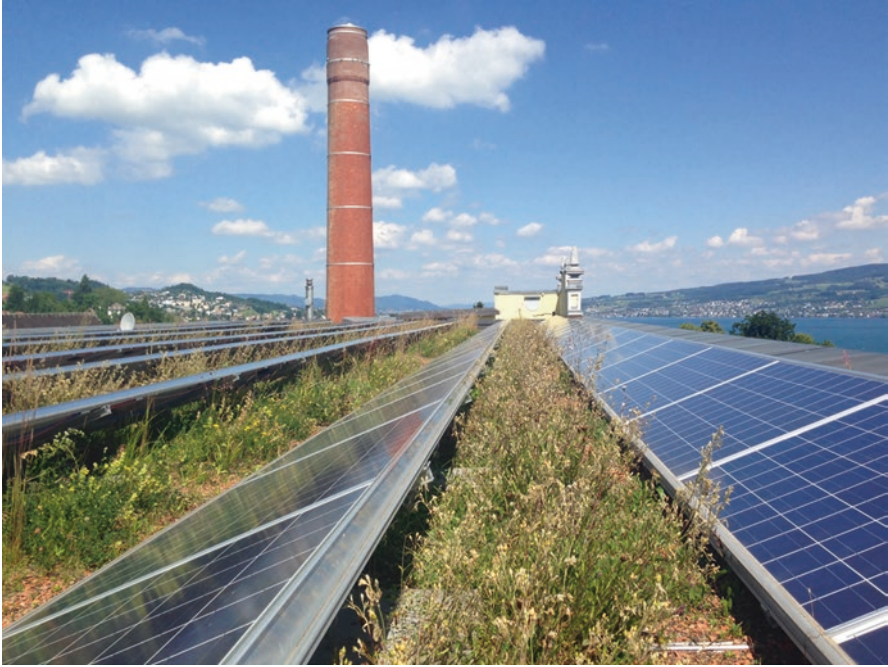
Fig. 10.10 Energy generation and green roofs in Switzerland