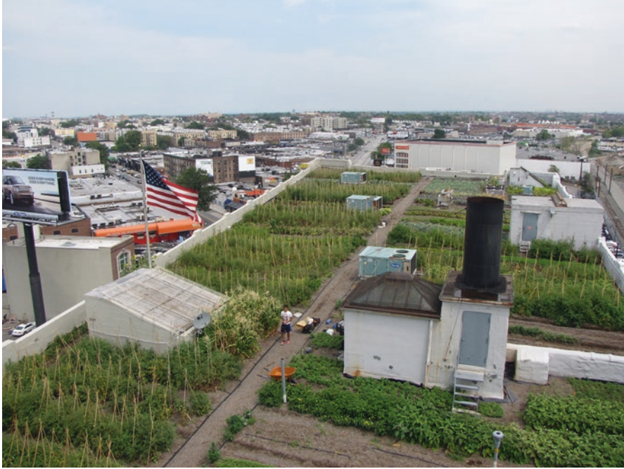
Fig. 10.8 Urban farming roof in the US

Tax incentives especially can have a major impact on green investment on roof level, as the intelligent model of split waste water tax (GAG) in Germany has demonstrated (FBB 2016). The strategy encouraged private property owners to manage their rainwater in a decentralized manner – on their own property. It effectively shared the responsibility of a public sector challenge with private property owners (FBB 2016). An improved extensive to semi-intensive green roof can hold up to 137 l/m 2 , a value comparable to one full standard bathtub. In heavy rain, the public drainage system is discharged. The retained water re-enters the urban climate cycle via evapotranspiration, and the substrate and vegetation turn the water into biomass and clean, cool air (Verband für Bauwerksbegrünung 2013).