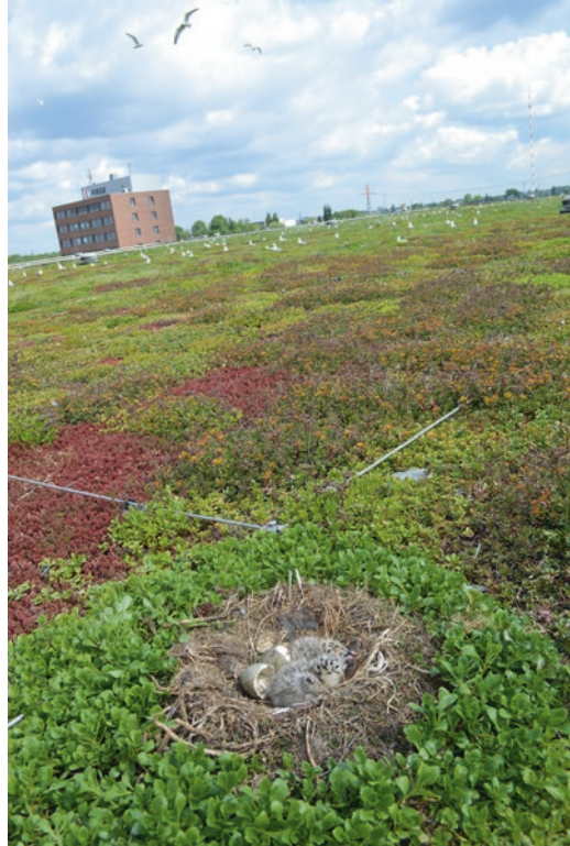
Fig. 10.15 Birds nesting on an extensive green roof in Germany

An understanding of general and local nature-based solutions state of the art and technology readiness is crucial (Derzken et al. 2015) resulting in targeted planning and implementation methods (Davies 2015), respecting the overall goal to create a functional, interlinked green infrastructure network (Hansen et al. 2016) in respect of ecological (Elmquist et al. 2015), economical (Peng and Jim 2015) and societal (Baggethun and Barton 2013) maximised impact (Fig. 10.15).