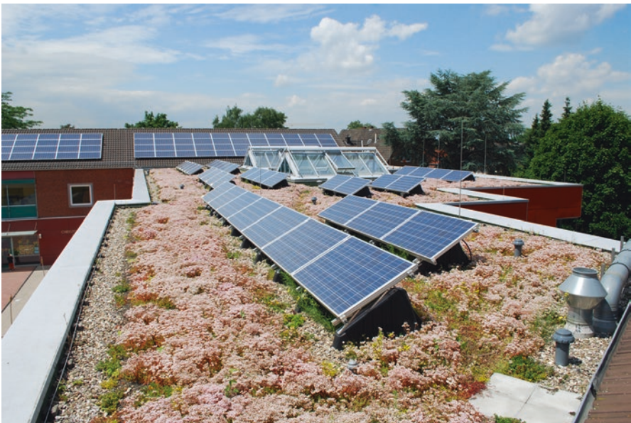
Fig. 10.11 Energy-Greenroof in Germany