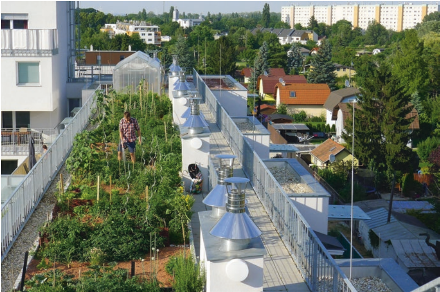
Fig. 10.7 Urban gardening roof “Oase22”, Vienna