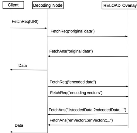
Fig. 3. Decoding at RELOAD/CoAP P2P overlay network.

decoding service. Figure 3 illustrates a scenario where the decoding service is requested. A fetch request by some client may involve fetching original data and encoded data, which also requires fetching the encoding vectors, so that the highest amount of sensor measurements is returned to the client.