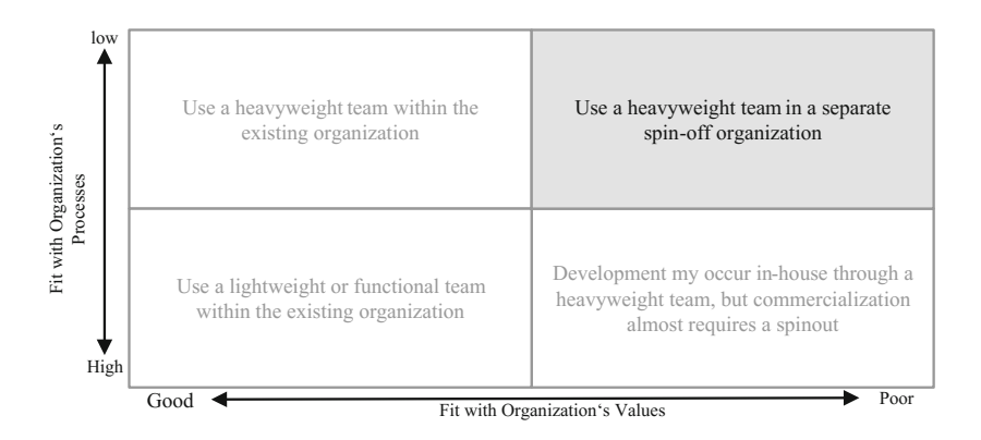
Fig. 1. Integration of innovative ideas in organization

Besides spin-off organizations there are more and more startup companies which focus on innovative product or business ideas. Spin-off and startup companies start without any given organizations. They need to build-up new organizational structures and processes. If the company focus is set on manufacturing processes compared to IT based innovation, the company needs more organizational structure directly from the beginning as there are usually more people involved. Manufacturing companies consist of different departments such as the production and manufacturing itself and several surrounding needed functions, e.g. purchasing, sales, material management, quality management, etc. Therefore structures and processes from startups developing software, where many examples can be found, can't be easily transferred. In 2011 IT based startup companies tried to focus on a new approach of developing software. Therefore software developers created a manifesto for agile software development. The Manifesto for Agile Software Development consists of four main principles [3]: