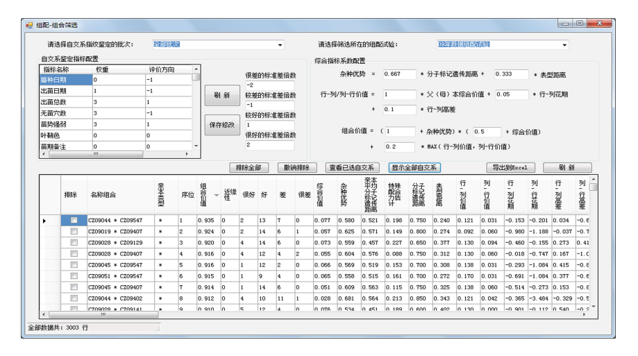
Fig. 3. The interface of hybrid combination order

78 inbred lines were got according to the inbred lines SSR data and phenotypic data screening. For each hybrid combination in this paper, it calculated the heterosis rates using formula 2, and calculated the orthogonal value or reciprocal value using formula 6, and calculated the comprehensive value using formula 8, then sorted the hybrid combinations by the comprehensive value (the sorting interface was shown in Fig. 3 below).