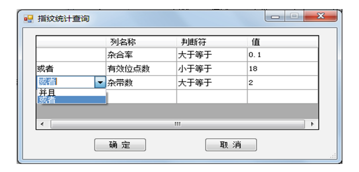
Fig. 2. The SSR fingerprint screening conditions of the inbred lines

Screening can be carried out only after put the SSR fingerprint into database and complete the eigenvalue calculation: the example in this paper screened according to the heterozygous ratio >=0.1 or the number of the effective site <=18 or the number of mixed band >=2. According to the screening conditions 94 inbred lines were removed (The screening condition interface is shown in (Fig. 2):