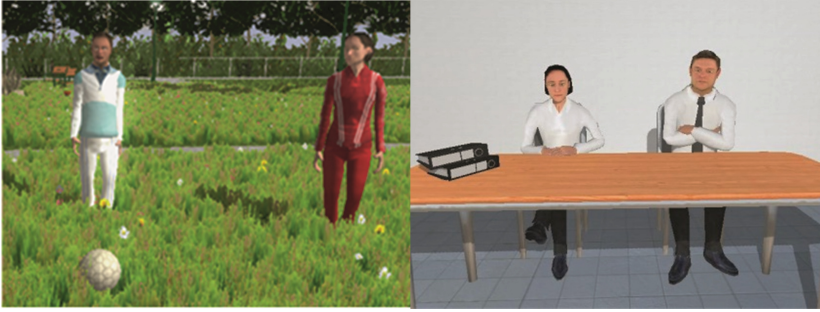
Fig. 1. The virtual Cyberball-paradigm (left) and virtual TSST (right)