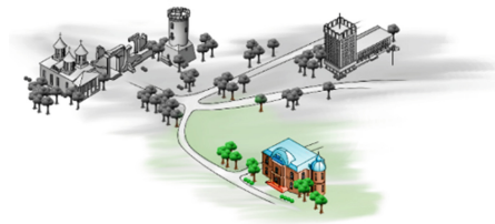
Fig. 3. Student activity in physical locations

When the player physically reaches a building, the game uses GPS coordinates from the device to determine the building and change its color on the map. If available, additional localization devices such as Bluetooth beacons or Wi-Fi base stations can also be used (Fig. 3).