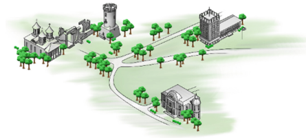
Fig. 2. Student activity within the game

When the player explores the virtual world, the background images changes color for the areas the players has visited (Fig. 2).