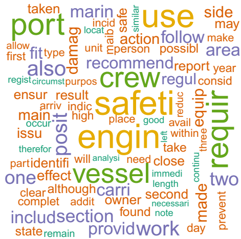
Fig. 2. This is a word cloud of the one hundred most frequent terms in the MAIB Corpus. The terms have been reduced to their stem using the SnowballC stemming algorithm.