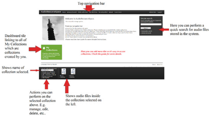
Fig. 2. ADAM dashboard