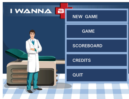
Fig. 3. Main screen