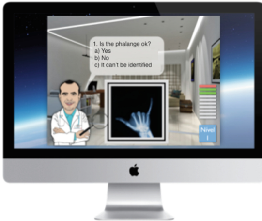
Fig. 2. MEDEDUC level model prototype [6]