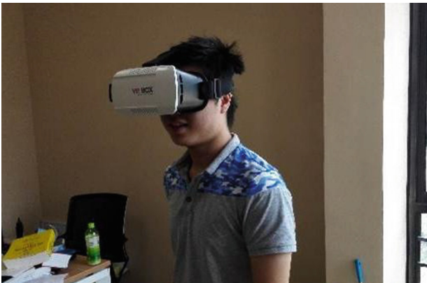
Fig. 3. The player wearing the glass does not need to take off his/her eye glasses