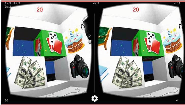
Fig. 1. The game as viewed from wearing the eye-glass

immersed (Fig. 1). The goal of such an environment is to train children's word identification skill (a key process in making sense of text) which is a cognitive skill that is commonly delayed in children with ASD (Randi et al. 2011).