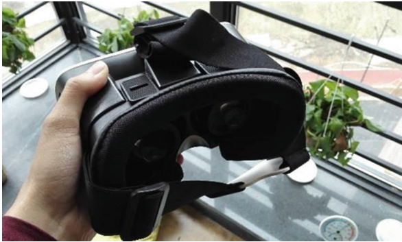
Fig. 2. The 3D glass (around US$12)

A pair of an affordable 3D VR glass (around US$12) is attached to a wide-screen Android phone, which are commonly used by many people in China today, as shown in Fig. 2. Figure 3 shows the look of the player wearing the eye glasses.