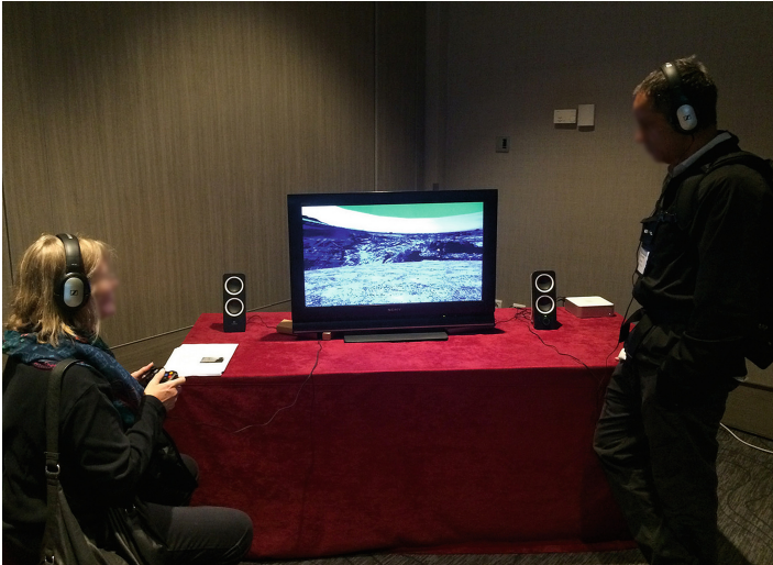
Fig. 7. Interaction with the VR environment running on the personal computer using the Xbox 360 controller. By manipulation a joystick on the controller, the participant can navigate and explore the virtual environment.