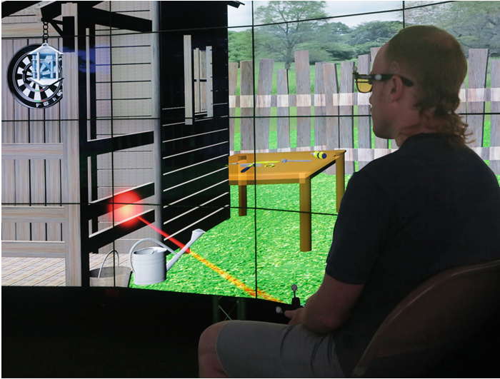
Fig. 5. Direct manipulation interaction in the CAVE2. By pushing a button on the Wand, the performer can point the virtual laser pointer and click on the watering can trigger object.

Direct manipulation was used to interact with trigger objects in each room. By pushing a specific button on the wand, the performer could point the virtual laser pointer and click on the trigger objects in the room (Fig. 5). The C# code example of wand pointing and triggering an object on multiple platforms is shown in Fig. 6. All input and event processing is done on the master node which then sends the final event trigger across the cluster.