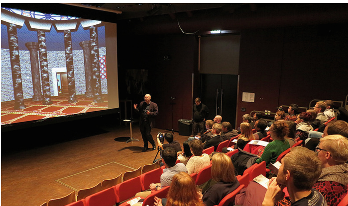
Fig. 1. Presentation of the project using the Xbox controller at Litteraturhuset Oslo, Norway

One of the goals of our project was to create a virtual environment with sufficient interaction complexity to show on several different VR platforms. To enable a more natural and user-friendly way of interacting with the virtual environment in the CAVE2, on the Xbox controller system running on personal computer, using the