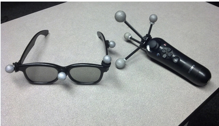
Fig. 2. CAVE2 input devices; the head and the wand controllers with retro-reflective markers for Vicon infrared optical tracking system.

This project was developed at the Electronic Visualization Laboratory (EVL) at the University of Illinois at Chicago, the birthplace of the CAVE2. The CAVE2 is powered by a 37-node high-performance computer cluster connected to high-speed networks to enable users to better cope with information-intensive tasks. It is approximately 24 feet in diameter and 8 feet tall and consists of 72 near-seamless passive stereo off-axis-optimized 3D LCD panels, a 36-node high-performance computer cluster plus a master node, a 20-speaker surround audio system, a 14-camera optical tracking system, and a 100-Gigabit/second connection to the outside world [1]. The CAVE2 provides participants with the ability to see three-dimensional objects at a resolution matching the human visual acuity, explore the environment, and hear surrounding spatial sounds around them, similar to how they hear in real life.