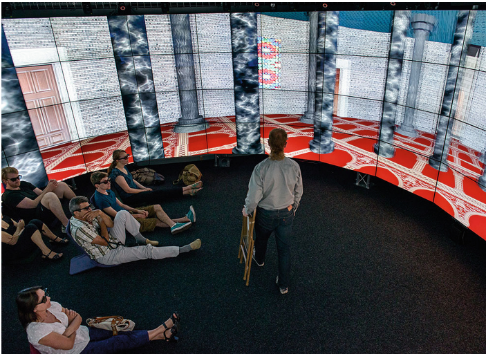
Fig. 4. Interaction in the CAVE2. The performer walks to one of the invisible interactive colliders holding a chair.

In order to navigate through our environment in the CAVE2, a participant needs to point the wand to move toward a specific direction and press a button to activate the transition into one of the soldier's stories. The fly mode has been disabled to ensure close proximity of the user to the interactive objects. We also implemented collision control to prevent navigating beyond the project visuals and getting lost in infinite virtual space.