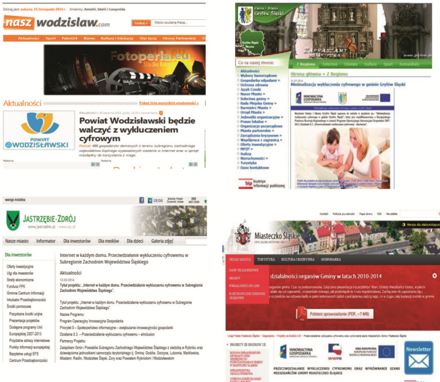
Fig. 6. Portals of Silesia agglomeration with exclusive quests

about exclusive phenomena presenting some initiatives and projects. Therefore the idea of development KPE seems to be very natural.