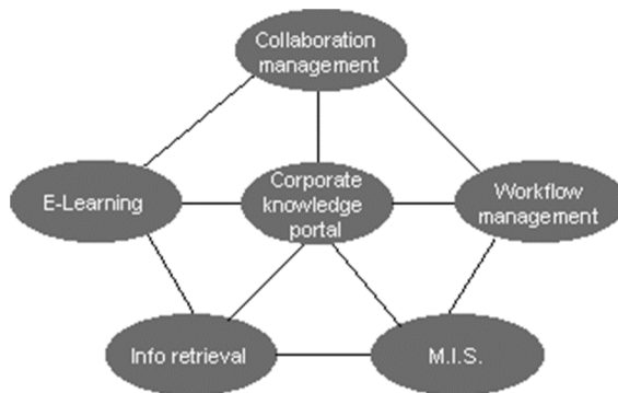
Fig. 1. Elements of Corporate Portals

Going further - Corporate Portal – can be defined as an integrated user interface, developing websites, and for the exchange of information, knowledge management in the company and the implementation of various business transactions. This is a point of access to all information resources and applications used. It integrates systems and technology, data, information and knowledge to function in the organization and its environment, in order to allow users a personalized and convenient access to data, information, knowledge, according to the tasks arising from their needs, anywhere, anytime, in safe manner and through a single interface. More advanced portals act as powerful workplace to ensure collaboration and exchange of documents. Figure 1 [24].