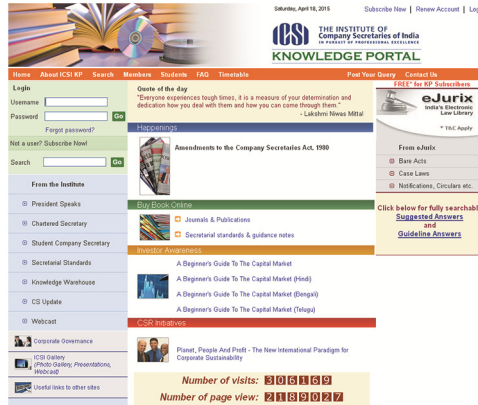
Fig. 3. ICSI - Knowledge Portal

Next presented KP is ICSI Knowledge Portal (ICSI-KP) “a capacity building initiative of the Institute of Company Secretaries of India (ICSI) for its members and students is a reservoir of knowledge enabling the users access to huge pool of information including Bare Acts, case laws, notifications and circulars issued by Government and regulatory authorities from time to time” – description available from eJurix on the ICSI KP home page Fig. 3 [23].