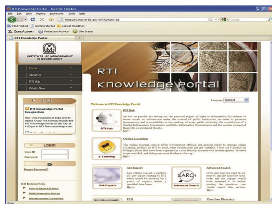
Fig. 2. An example of RTI Knowledge Portal

One of the oldest knowledge portals is presented in Fig. 2 (see: [19]). Main functionality of the portal concerns to co-operation with experts, e-learning offerings, Case Law Directory apart of typical FAQ (frequently asked questions) capabilities.