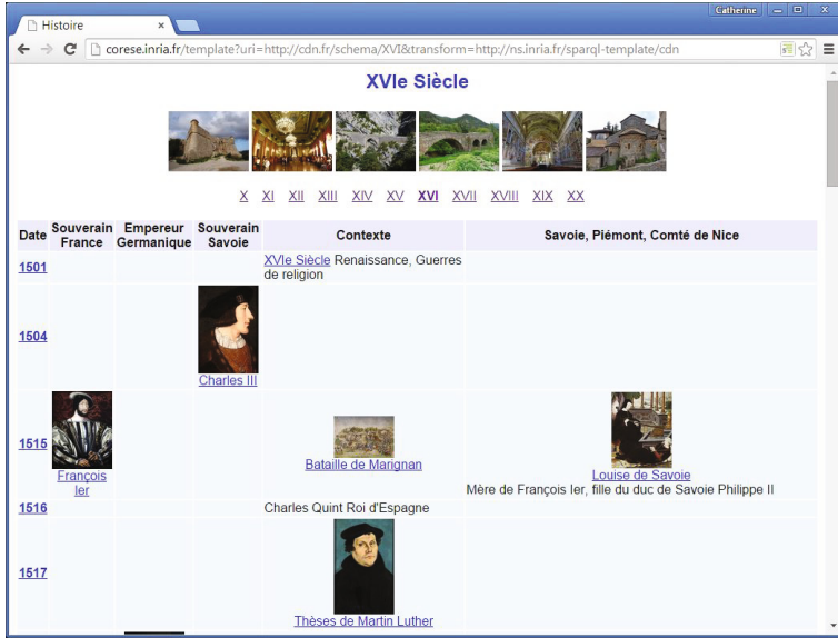
Fig. 3. History Navigator