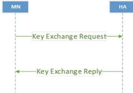
Fig. 3. Intra-domain Secure Mobile Management Scheme

Key Exchange Request is generated by MN and sent to HA. Code is the message type. MN is Source and HA is Destination . g^m is the parameter of Diffie-Hellman key exchange in the Payload , where g is public parameter in the home domain and m is the secret value chosen by MN. After sending the message, MN expects to get reply within Time .