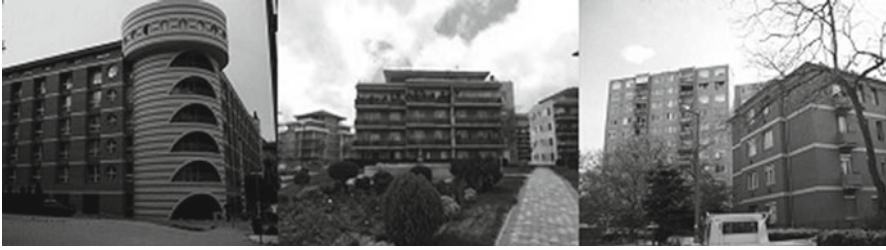
Fig. 4 The three residential sites: Orczy Building (marked no. 2 on Fig. 1), Taraliget Residential Park (marked no. 3 on Fig. 1) and Hungária Avenue 5-7 (marked no. 4 on Fig. 1)

Residential Park and the Orczy Building. Though surrounded by unused industrial buildings and the ruins of Communist era construction, these two buildings are considered as quite trendy and ‘fancy’. The Orczy Building – situated less than one kilometre from the market – was built in the early 2000s. Taraliget Residential Park, the newest of the researched sites of interaction, is a high prestige residential park built by a Chinese company, surrounded by a fence, and also situated less than one kilometre from the market.