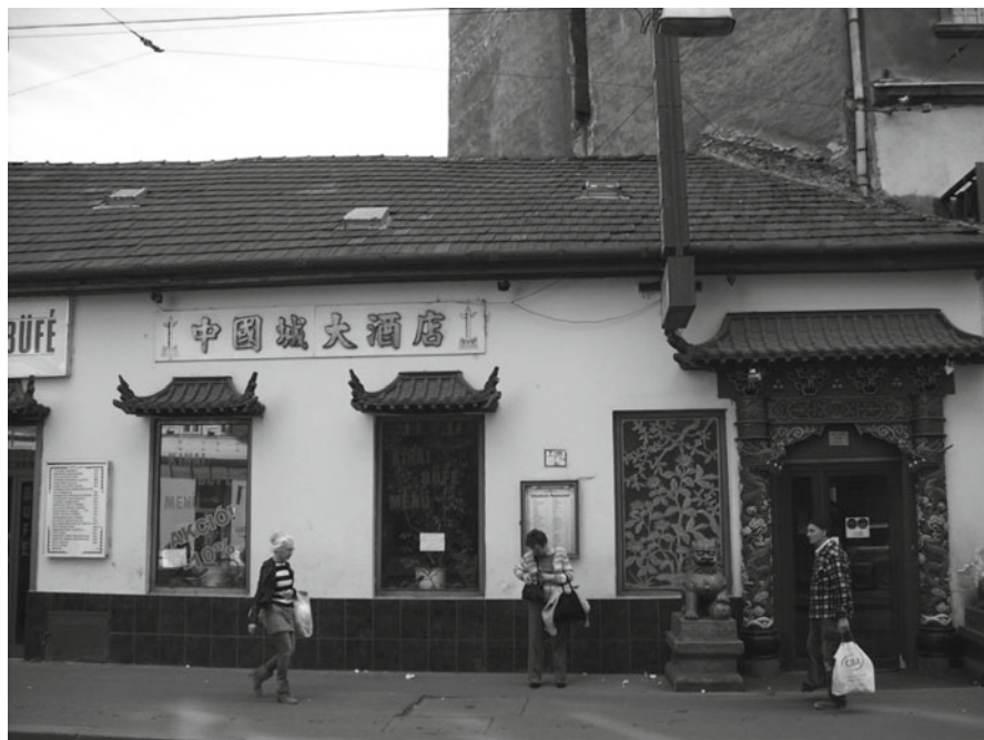
Fig. 3 Chinese restaurant in Népszínház Street

At the same time, one positive feature cannot be disregarded, not even by the most prejudiced Hungarians: the market plays a crucial social function for Hungarians since in Józsefváros there is a segment of residents that would not be able to afford new items if the market did not exist (Fig. 3).