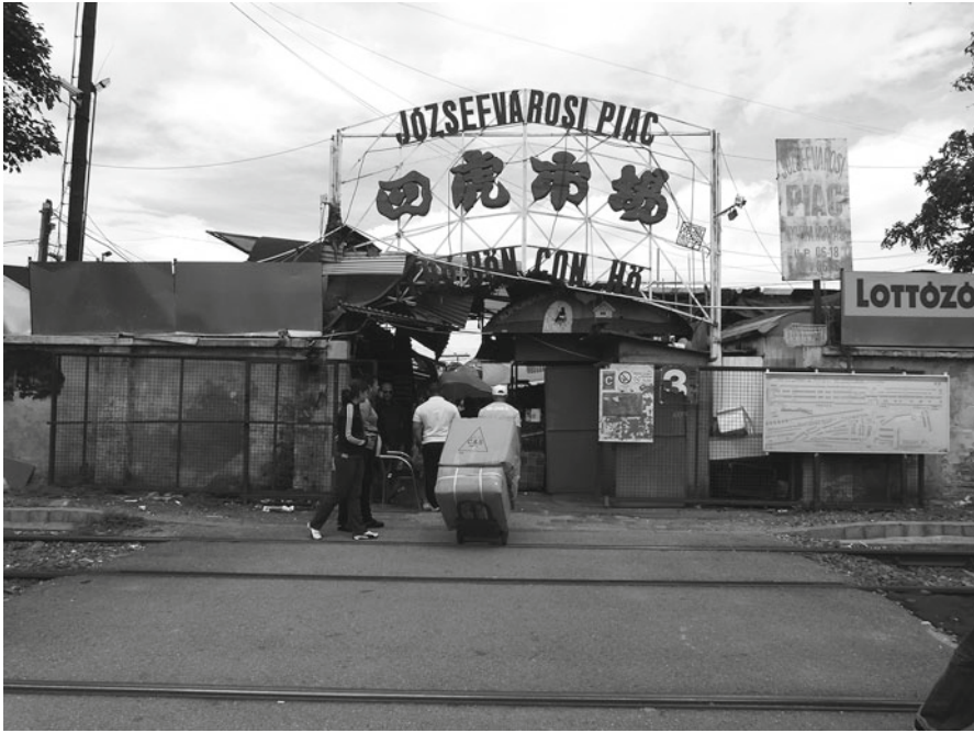
Fig. 2 Entrance of the ‘Four Tigers Chinese Market’

Our findings confirm Nyíri’s (2010) arguments: Chinese migration to Hungary has been mainly driven by economic motives. All of our Asian interviewees mentioned business as the main reason for their move. As explained by Tilly (2007 [1993]) and Nyíri (2010) their migration was supported by extremely strong transnational ethnic bonds; the final decision to migrate to a given country is generally initiated and supported by relatives or acquaintances already settled in the target country. On arrival many of our interviewees knew nothing about Hungary or Budapest in general or about Kőbánya or Józsefváros in particular, except for the existence of the Four Tigers Market: this is hyper-localized transnational migration from a specific Chinese region to a specific area in Budapest. A common practice among first-wave migrants was to leave their children in China and send for them a few years later when the circumstances were appropriate.