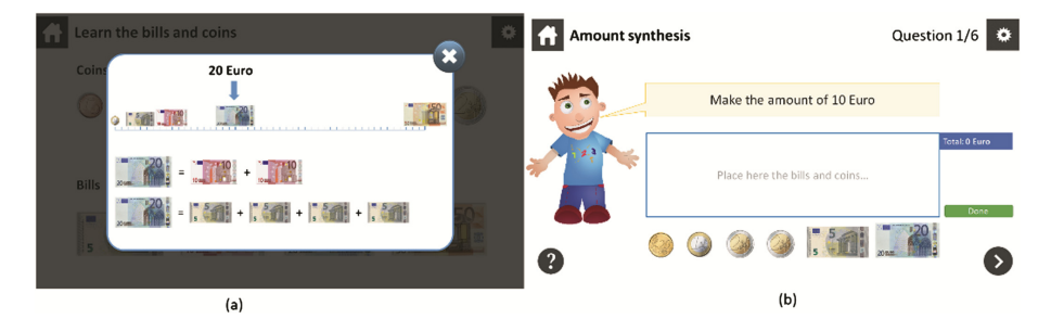
Fig. 5. (a) Learning coins and bills (b) Amount synthesis exercise

representing different coins and bills, from the smallest to the largest. (3) Amount comparison , where users are asked to identify the largest (or smallest) of two amounts. (4) Amount analysis , in which users are asked to identify and separate the cents and the euros for a given amount. (5) Amount synthesis , in which users are requested to create a given amount using specific coins and bills (see Fig. 5 b). (6) Shopping , where users select a specific store (i.e., super market, bakery, bookstore, toy store, clothes store, shoes store) and are asked to: (a) shop products, pay with virtual money in a virtual wallet and indicate whether they should receive any change back (b) purchase products of a given shopping list, pay with virtual money in a virtual wallet and indicate whether they can buy with virtual money the price of a given shopping basket (d) indicate which products they can buy with a given amount in their virtual wallet. (7) Find the correct behavior , where users have to select the correct answer between two options, one of which is inappropriate in a monetary transaction context (e.g., I don't eat something I took from the shelves unless I pay for it first vs. I can eat it in the store before paying it).