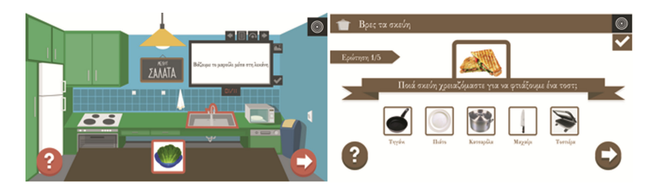
Fig. 6. Cooking game (a) Recipe step (b) Collect the utensils