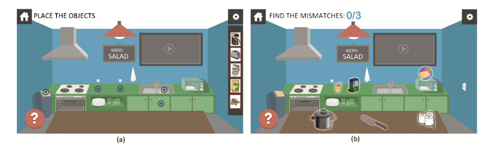
Fig. 4. Indicative screenshots (a) Place the objects correctly in a room (b) Indicate objects that should not be found in a specific room