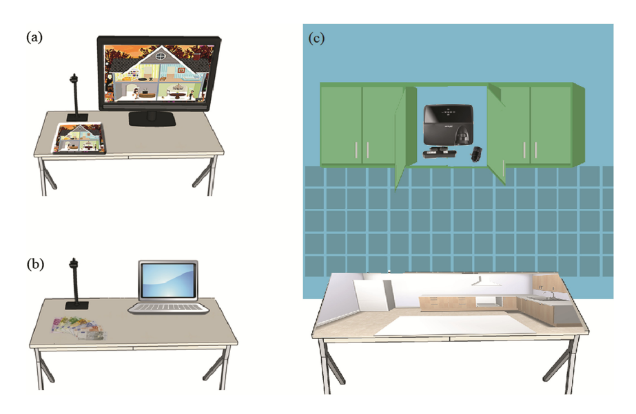
Fig. 1. Representation of the system setups: (a) Learning the home environment (b) Learning about money and monetary transactions (c) Learning how to cook

One key characteristics of the aforementioned interactive systems is the ability to frequently update their content to be harmonized with the current educational activities