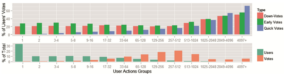
Fig. 1. Top: Percentage of a user’s votes which correspond to the three ‘expert’ voting behaviors. Bottom: Percentage of total users and votes for each activity level group.

The most active voting users diverge from their less active peers by the frequency of their votes, but also by the nature of their votes – to the extent that they can be considered a class of voting ‘superparticipants’ [14]. These voting superparticipants are more likely to cast down-votes, are more likely to vote on fresh posts (first 20 votes cast on a post) and are more likely to vote quickly (voting within 10 s of their previous vote). Figure 1 shows the prevalence of these behaviors in user groups defined by activity level.