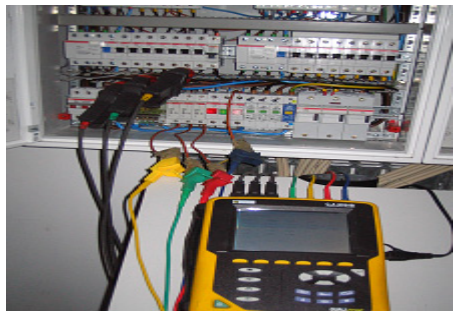
Fig. 1. Measuring Equipment - Power Analyzer in the Collection of Consumptions

This consists of gathering information for determine energy savings from a perspective of energy determination of equipment that can induce forced stops away the power supply, for wear and tear or malfunction resulting from higher operating temperatures and lead to a rapid degradation.