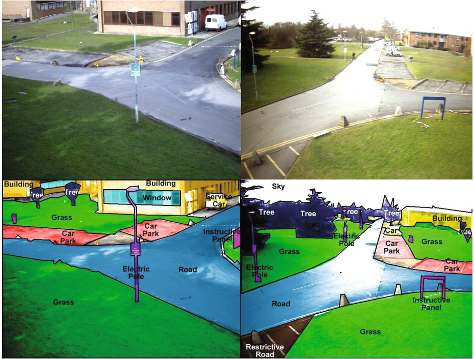
Fig. 2. Scene Representation from PETS 2012 challenge camera views