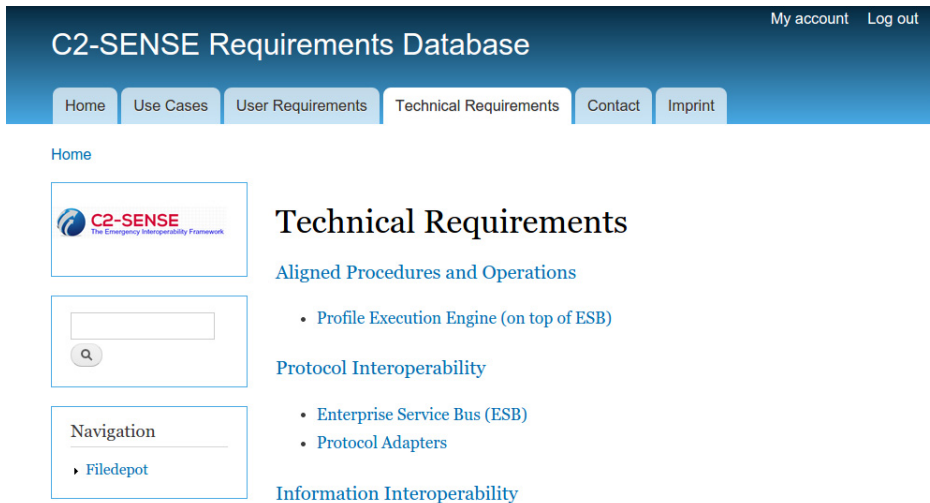
Fig. 2. Screenshot of the Requirements Database platform of the C2-SENSE framework

In short, the platform is a web page 3 , on which each project partner has a possibility to log and submit the changes to the existing requirements, or to provide new requirements (see Fig. 2). The web platform is structured in a way that the distinctions and relations between the technical and user requirements are very clear. This should increase the efficiency and understanding among the project partners.