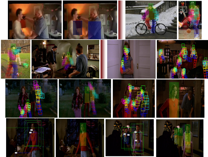
Fig. 2. First Row - (Left Column) The figure shows the torso and human body detections using our adaptive threshold with the poselets, without which no parts were detected. (Right Column) The figure shows some accurate FMP detections (belonging to the class C_1 ). Second Row - (Left Column) The figure shows FMP detections for the class C_2 where the head and torsos can be trusted, but not the limbs. (Right Column) The figure shows some FMP detections belonging to the class C_3 . In such a case, the FMP detections cannot be trusted at all. As a result, our algorithm then depends solely on the torso and head detections from the poselets. Third Row - The figure shows the torso and human body detections using poselets, where the FMP detections belonged to the class C_3 . Fourth Row - The figures show multiple torso and head detections using poselets. Using the approach specified in Algorithm 1, the correct torso detections were found out. Best Viewed in Color.

Poselets have a major advantage of predicting the viewpoints of body parts as compared to FMPs. However, since we do not model viewpoints in our framework, and the number of masks associated with the limbs in the poselets are comparatively much lesser than those of torso and head; we use poselet estimations only for the torso and full human body detection. For poselets, we perform detections using the code provided by [2]. We observe that the detection threshold (the probability score above which the torso detections and human detections are considered valid) set in the code of [2] many a times misses some key torso/poselet detections. Thus, we make the detection threshold for poselets adaptive in nature, i.e. we consider all poselet firings until atleast two torsos are detected in an image. The threshold can also be adapted so as to make more than a minimum of two torso detections, but we choose only two, since we do not have collective activities in our video datasets. We then note the returned probability scores for various torso and human body firings with poselets, note their regions of