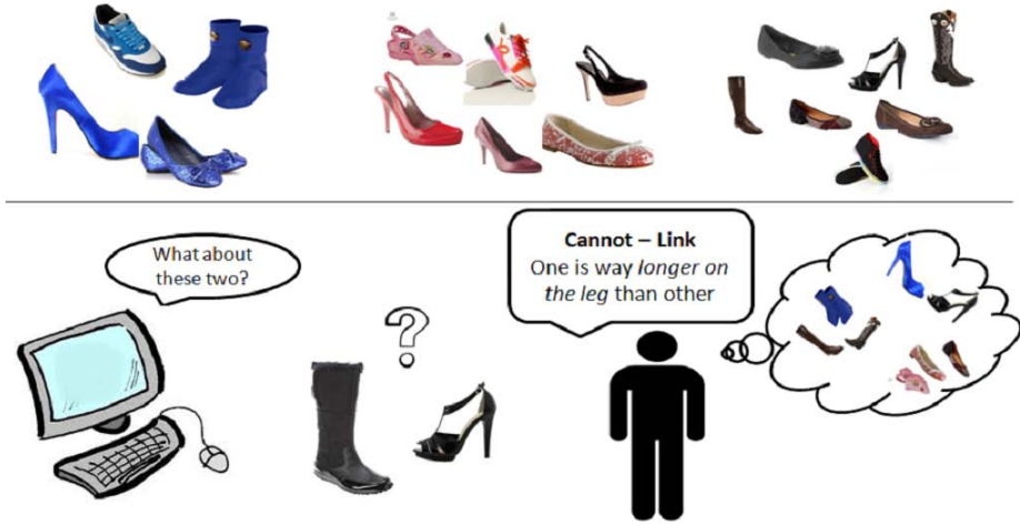
Fig. 1. An Illustration of our approach. The system interactively queries the user with a pair of images, and solicits “must-link” and “cannot-link” response along with an attribute-based explanation. Using attribute predictors, the system can automatically generate additional pairwise constraints.

must-link or cannot-link, indicating that the two images in the pair should belong to the same cluster or different clusters resp. These constraints allow the user to inject their domain knowledge or preferences in the clustering algorithm.