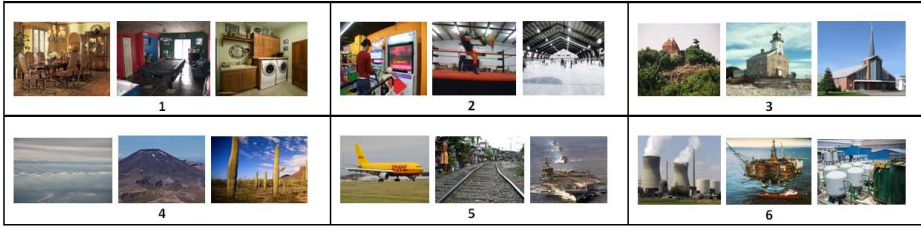
Fig. 2. These are the 6 ground truth clusters in SUN600 dataset. They correspond to categories like transportation, industrial regions, sports/recreation etc.

(\mathbf{x}_i, \mathbf{x}_j) from user feedback. In spectral clustering, the affinity matrix A captures the similarity of datapoints. If the confidence of a cannot-link constraint (\mathbf{x}_i, \mathbf{x}_j) is c , we set A(i, j) = 1 - c , and if the confidence of a must-link constraint (\mathbf{x}_i, \mathbf{x}_j) is c , we set A(i, j) = c . COP K-Means does not allow handling of soft constraints and so we modify it slightly. During the assignment of a point to a cluster, instead of computing the number of violated constraints, we assign a datapoint to the cluster with the least sum of confidences of violated constraints.