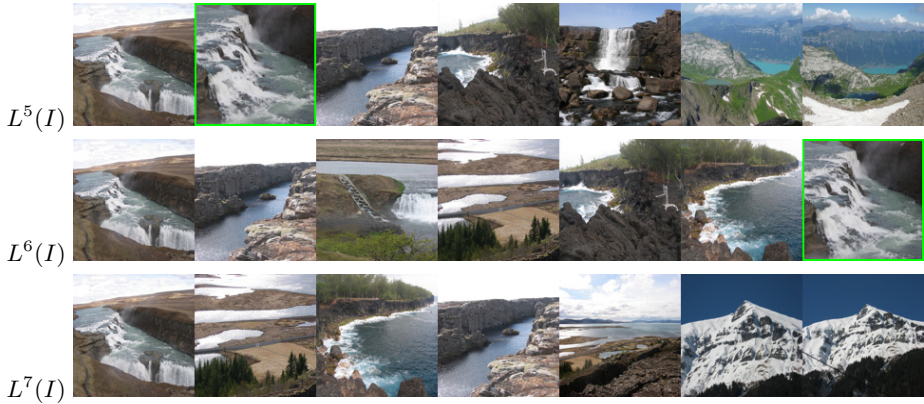
Fig. 2. A retrieval example on Holidays dataset where Layer 5 gives the best result among other layers, presumably because of its reliance on relatively low-level texture features rather than high level concepts. The left-most image in each row corresponds to the query, other correct answers are outlined in green.

Overall, the results obtained using L^6(I) -codes are in the same ballpark, but not superior compared to state-of-the-art. Their strong performance is however remarkable given the disparity between the ILSVRC classification task and the retrieval tasks considered here.