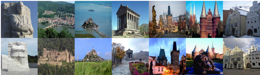
Fig. 7. Examples of training pairs for discriminative dimensionality reduction. The pairs were obtained through time-consuming RANSAC matching of local features and simple analysis of the resulting match graph (see the text for more details).

the graph but are not neighbors themselves (to ensure that we do not focus the training process on near duplicates). Via such procedure we obtain 900K diverse image pairs (Figure 7). We further greedily select a subset of 100K pairs so that each photograph occurs at most once in such a subset, and use this subset of pairs for training.