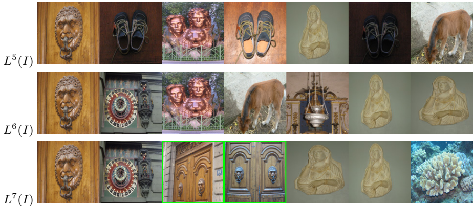
Fig. 3. A retrieval example on Holidays dataset where Layer 7 gives the best result among other layers, presumably because of its reliance on high level concepts. The left-most image in each row corresponds to the query, other correct answers are outlined in green.