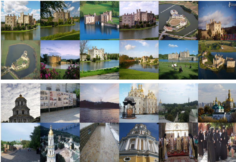
Fig. 4. Sample images from the "Leeds Castle" and "Kiev Pechersk Lavra" classes of the collected Landmarks dataset. The first class contains mostly "clean" outdoor images sharing the same building while the second class contains a lot of indoor photographs that do not share common geometry with the outdoor photos.

than to landmark photographs. To confirm this, we performed the second re-training experiment, where we used the Multi-view RGB-D dataset [12] which contains turntable views of 300 household objects. We treat each object as a separate class and sample 200 images per class. We retrain the network (again, initialized by the ILSVRC CNN) on this dataset of 60,000 images (the depth channel was discarded). Once again, we observed (Table 1) that this retraining provides an increase in the retrieval performance on the related dataset, as the accuracy on the UKB increased from 3.43 to 3.56. The performance on the unrelated datasets (Oxford, Oxford-105K) dropped.