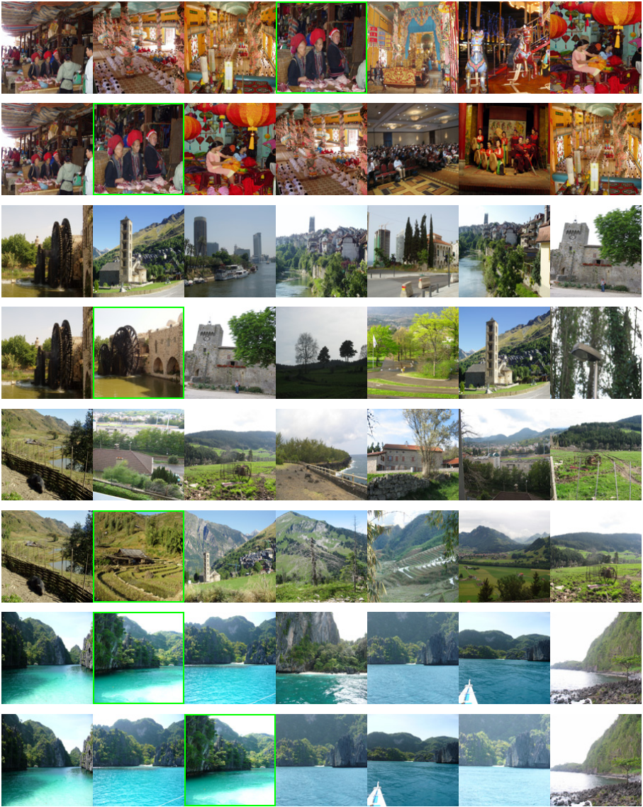
Fig. 5. Examples of Holidays queries with large differences between the results of the original and the retrained neural codes (retraining on Landmarks). In each row pair, the left-most images correspond to the query, the top row corresponds to the result with the original neural code, the bottom row corresponds to the retrained neural code. For most queries, the adaptation by retraining is helpful. The bottom row shows a rare exception.