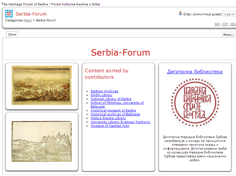
Fig. 1. The Serbia-Forum homepage

The Serbia-Forum ( www.serbia-forum.org ) is a web application with the goal of preserving digitized units of cultural heritage which are significant to the republic of Serbia [1, Fig. 1]. The web application is based on dynamic content generation and presentation delivered by the JSP Wiki framework, running on the Tomcat 7 web server. From the beginning of its development in March of 2012, the web application is built to serve two specific purposes.