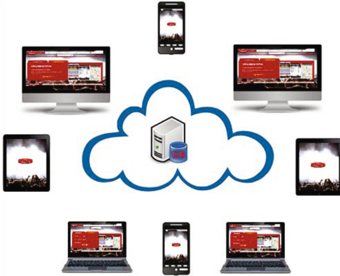
Fig. 1. Global vision of the LifeSpeeder platform

case, then it goes directly to step 2. If no ID was sent then the device will be registered in the system with a new generated ID, which is then sent to the device in step 4, along with the response of the request.