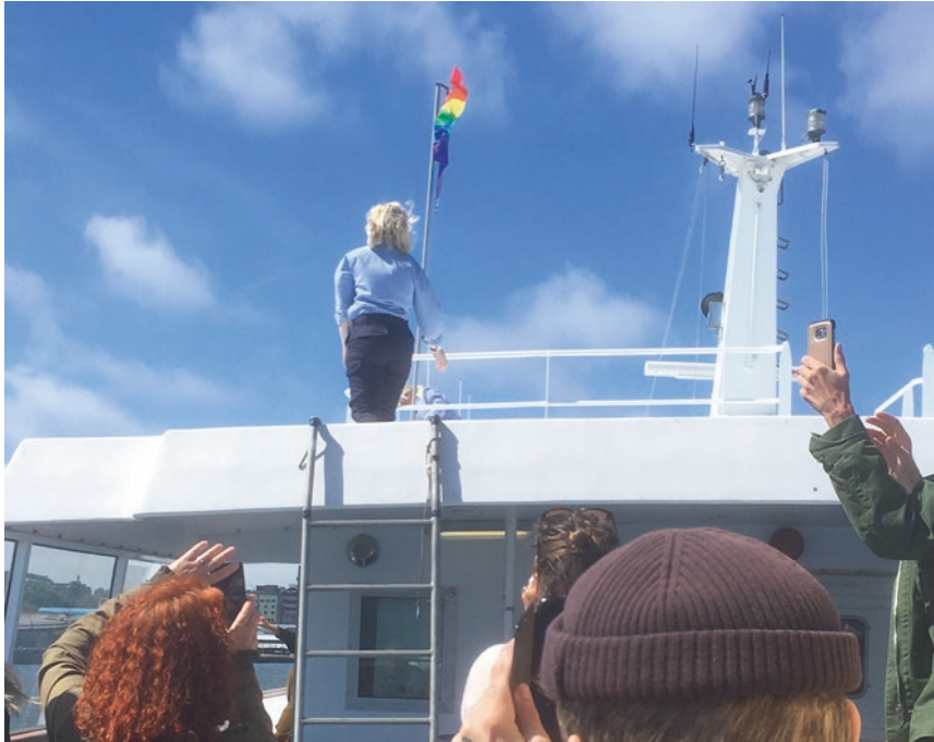
Fig. 6.2 Taking photos of the raising of the rainbow flag.

We arrive at the stage, it is close to Trubaduren, a well-known restaurant/hotel at Hönö Klåva that is hosting/sponsoring the event—and, of course, will also earn a lot of money this day. It is crowded with people. Nearly every political party is there with its own table and pamphlets, everyone but the Christian Democrats (Kristdemokraterna, KD), who govern the municipality, and the Sweden Democrats (Sverigedemokraterna). Over the course of the day I see and/or meet almost everyone that I have interviewed, except the man from KD. Families, children, older people and a lot of obviously gay and/or queer people are mingling. The music is loud and the place is crowded. I start to feel alienated. What am I doing here? Why did I come here by myself? I am not going to be able to talk to someone or do the mini-interviews that I had in mind as my work for the day ... it is