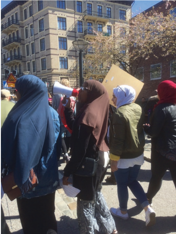
Fig. 4.1 Young woman with a megaphone

hand to hand. This picture and practice challenged notions of the oppressed Muslim woman in need of help (Abu-Lughod 2013). The voices on the march were strong ones, and the echoes among the buildings increased their effects. Two times after each other, they called out (Fig. 4.1):