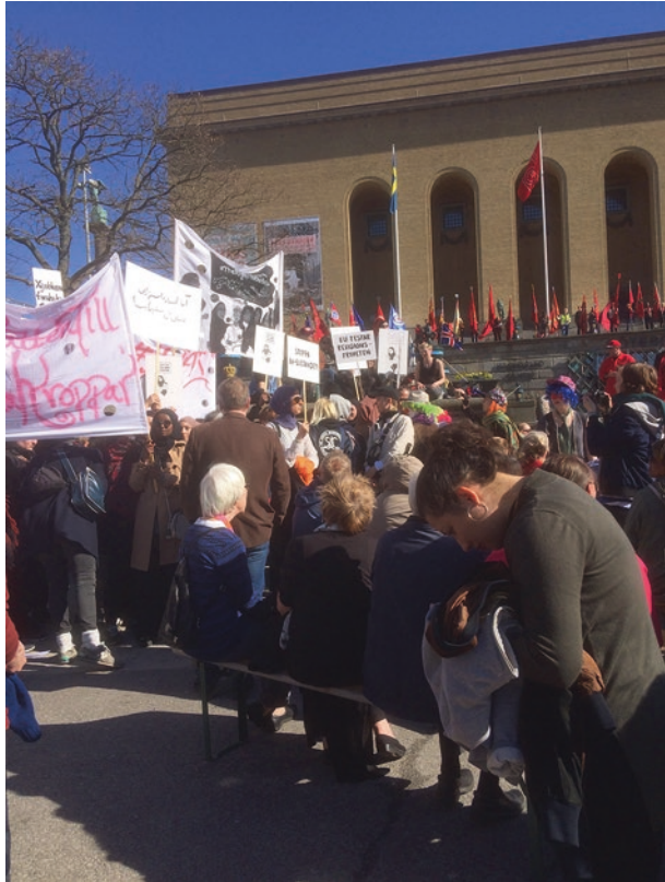
Fig. 4.4 Intervention in to the Social Democratic party's meeting at Götaplatsen

I took pictures with my phone, and when Abdullahi and I looked at them several months later, she tried hard to remember the details of what had happened. She recalled that she had felt a bit embarrassed standing there in silence. I remembered that I had been quite affected by this very performative intervention into a hegemonic social order normalised to act and dress in certain ways. I had understood it as an interpellation to the governing party to act and recognise also these women. Through their political act, they raised a number of questions: Who counted as workers in the Swedish workers' movement? Which women should receive possibilities for gender equality? Who counted as Swedes for whose rights the