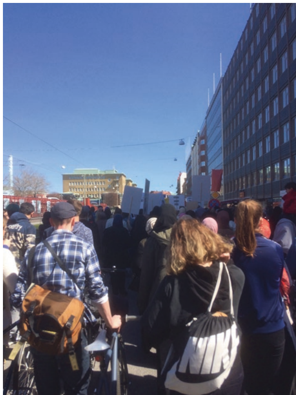
Fig. 4.2 The allies come last

who wants to contribute [...]. Also this, to perceive that we have many persons around us, with whom we both work and cooperate and who we have in our everyday life, who in different ways identify themselves as anti-racist and who are anti-racists. And here, you have a possibility to join in something you will not necessarily get cred for, but it is the principle that you are with. [I] think it was something like that.