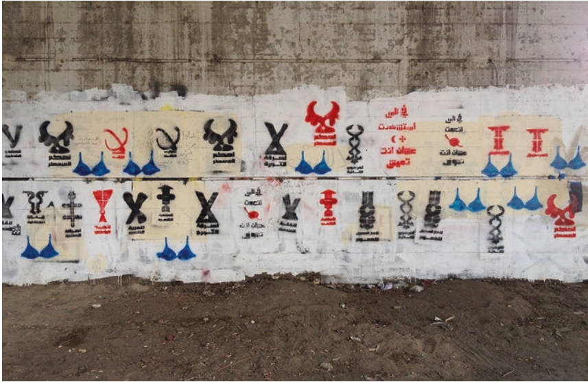
Fig. 3.3 Elements from the ‘No’ campaign. Stencils and photograph: Bahia Shehab.

others, the blue bra) and the words of Pablo Neruda: ‘You can cut all the flowers but you cannot keep Spring from coming’ (Fig. 3.3).