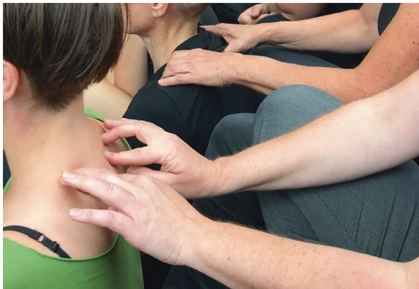
Fig. 6.1 Care at Reclaim Pride.

celebrations, started feminist cafés, consciousness-raising groups and so much more. I am simultaneously both proud and ashamed. Proud for what I have done and even more for what some of my friends have done. Ashamed that I stopped being an activist. I got married. I had a child. I lived the ultimate heteronormative life, except it was with another lesbian. But still. I struggle with myself and my feelings of belonging and disbelonging, of pride and shame. I also observe how, due to my own feelings of insecurity, I risk being exclusionary myself as soon as I feel safe with my crew. How I greet high-status members of the queer community with extra warmth; how confident I am that I know some of them, can even hug some of them. Ashamed again. What am I doing? What am I trying to prove? And to whom? I guess it is a way to make myself feel that I do belong even though I spend most of my time at the university and with my family.