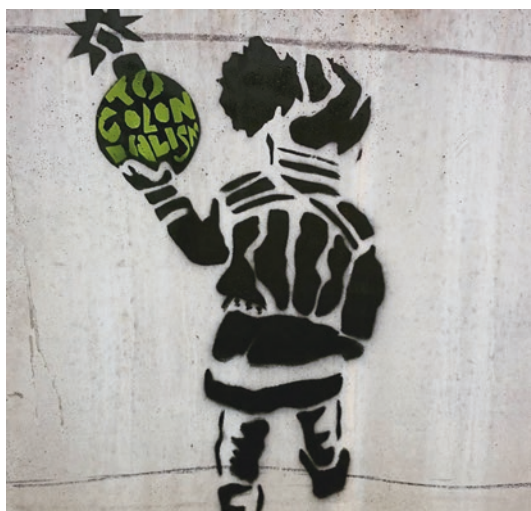
Fig. 3.1 'To colonialism'. Stencil and photograph: Anders Sunna.

The focus on street art partly implies a centring of visual expression, which necessarily excludes other ways of communicating and experiencing protest (e.g., written, spoken or sung communication, physical pain, emotional reactions). We draw here upon Lisiak (2015: 4), who concludes that: 'analysis of revolutionary iconography is important because it is [...] protesters' lingua franca' (see also Buck-Morss 2002). However, the delimitation to visual expressions still offers a variety of possible perspectives. We start by briefly delving into the analytical possibilities opened up by relating the studied expressions to the associations, practices and aesthetics associated with street art.