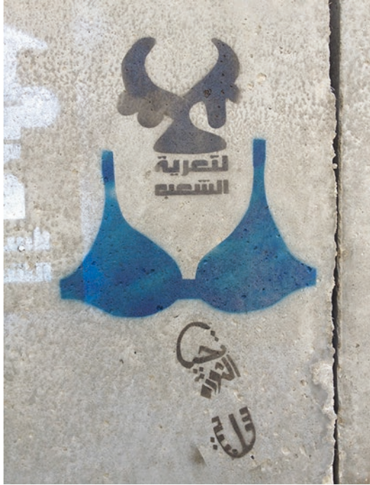
Fig. 3.2 'No to stripping...' Stencil and photograph: Bahia Shehab. Courtesy of the artist

The latter is one of the more famous pieces in the series, originally commenting on a notable incident in which a veiled protesting woman was violently stripped and beaten by military men. The incident was filmed and circulated on the internet, and international broadcasters such as CNN and the National Post covered the story of the beaten young woman. The media images show three policemen dragging the woman's unconscious body: her hijab and long black abaya ripped off, exposing her stomach and her blue bra. Shehab's artistic comment consists of a stencil of a blue bra and a footprint representing the military that reads 'Long live a peaceful revolution'. In her TED talk, Shehab says it represents a 'reminder of the shame' of Egypt for allowing such actions and that 'we will never retaliate with violence'. The blue bra quickly became a cultural product itself and a symbol of the protests after the Egyptian