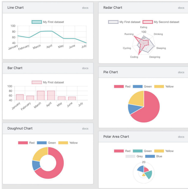
Fig. 2. Different types of charts from ChartJS

of writing components. Our system could potentially consist of hundreds of metrics, and reusing existing components while at the same time having impressive performance is critical.