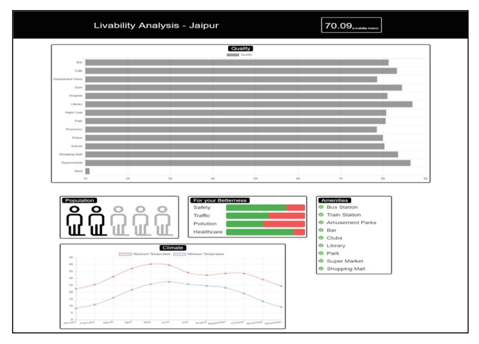
Fig. 3. The screen-shot-2 of tool's User Interface for Livability Analysis