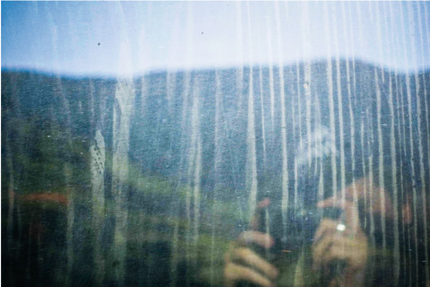
Fig. 9.4