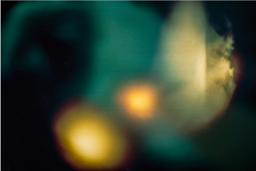
Fig. 9.5 Image copyright © Melis Cantürk and reproduced by permission. Source: In Pursuit of Error [8]

through movement or manipulation the subversion foregrounds the photographer as an embodied presence in the act of making photographs in a similar way that the accident reveals the camera’s subjective viewpoint. The subversion interposes the photographer between the camera and the scene as much as if a stray thumb or forefinger were to appear in the frame—we are reminded that the camera is not simply alone and recording by itself as an objective observer. The subversion reminds us that there is a photographer who is pointing, choosing, moving or otherwise governing the activity that precedes the image.