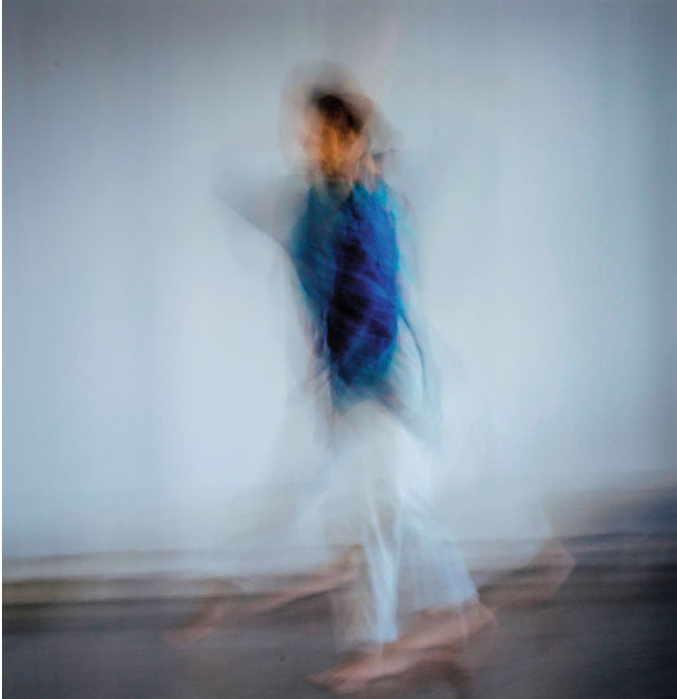
Fig. 9.3

the sole locus of creation, the error reveals the multiple secondary elements: light, time, subject, background; the numerous observable and unobservable phenomena that can impinge on the image. The accidental error reveals the momentariness of the photograph, its situatedness in time and space and its fixed location and view-point. Conventional photography practices strive to present a scene which is as far as possible universal, a witness to an event rather than a participant, working at an observing distance which lends the scene a sense of objectivity and ‘truth’. This photographic stance, as common in newspaper reportage as holiday snaps, relies on a detachment between the photographer/camera and the scene, either through pose or ‘stilling’ of the action (‘smile!’) or through remaining on the periphery. By contrast, the accidental error provides incontrovertible evidence of the embeddedness of the camera/photographer within the flow of space and time through which pours all that is normally left out of the photograph (Fig. 9.4). Through happenstance the error records these fleeting intrusions and rapid changes that make up our customary lived experience, fixing for a second the swirl of life that we are part of.