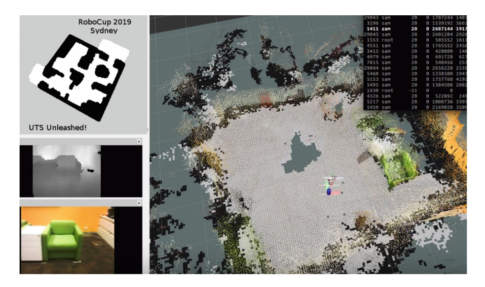
Fig. 2. RoboCup@Home SSPL arena gridmap used for global path planning and visualization on the top left corner. The rest of the image is an example of the 3D pointcloud and default gridmap provided by RTAB-Map with some real-time RGB+Depth data shown in the lab.

the different tests while taking care to face the robot towards fixed landmarks. Examples of landmarks are walls, doors and other fixed furniture like kitchen sinks. We also positioned the head of the robot to look at a 45^{\circ} angle towards the floor to maximize the amount of close-range, visible features that can be recognized for localisation later. Some rosbags were used for the mapping process, while others were used for map verification.