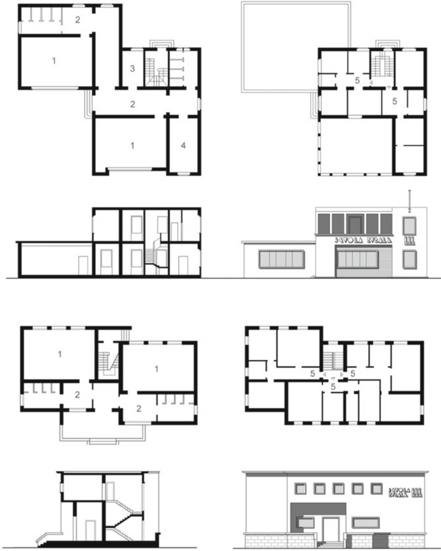
Fig. 4 A. Pappalardo: above, Rural school in Borgo Hermada, 1934. (Redrawing based on the materials stored at ACS, Opera Nazionale Combattenti, fondo progetti, 19/24 Componenti dei progetti : 3. Scuola rurale , Roma.); below, Rural school in Borgo Montenero, 1935 (Redrawing based on the materials stored at ACS, Opera Nazionale Combattenti, 32/2 Borgo Montenero. Disegni , Roma) (1. Classroom; 2. Changing room; 3. Teachers' room; 4. Library; 5. Teachers' apartment)