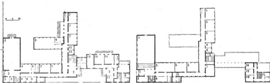
Fig. 5 C. Petrucci, Project for the Aprilia school building, 1936. On the left: Ground floor plan. (1 gym, 2 lobby, 3 clinics, 4 offices, 5 changing rooms, 6 showers, 7 classrooms, 8 refectory, 9 pantry, 10–11 managing offices, 12 guardian apartment, 13 dormitories, 14 kindergarten classroom). On the right: First floor plan: (1 gym, 2 secretariat, 3 presidency, 4 administration, 5 conference hall, 6 classrooms, 7 library, 8 management offices, 9 teachers, 10 bedroom, 11 living room) (Carbonara 1946)

In Pomezia, after the end of the ONB as an institution in 1937, the school complex will again find its own independence, albeit associated with the building of the GIL (Italian Youth of Littorio), an organization that would have replaced the ONB.