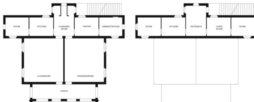
Fig. 3 Rural school, Casale delle Palme, 1922. Redrawing based on the image published in Secchi (1923)

part was a two-storey volume with, on the ground floor, the kitchen, the pantry and the principal’s office and, on the first floor, the teachers’ apartment.