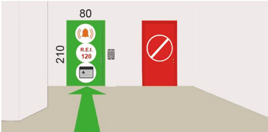
Fig. 3 Example of doors representation with the information for the rescuer