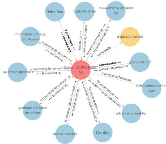
Fig. 2. Visualisation of Given Consent in the data graph (using GraphDB)

In the consent dialogue, the use of independent radio buttons was interpreted as allowing the user to consent and withdraw for each individual purpose, which was represented by creating separate instances of consent for each choice. We modelled the dialogue as an instance of gdprov:ConsentAgreementTemplateBundle consisting of several gdprov:ConsentAgreementTemplate instances to represent multiple individual consent entities. We had difficulty in interpreting the language used for third parties as it suggests the user is giving consent directly to third parties rather than to Quantcast. Pending clarification from legal experts, we chose to represent these as data recipients rather than as Controllers or Joint-Controllers for ease of testing. This allowed us to represent the data sharing processes in a concise manner with each purpose being associated with the hundreds of third parties listed in the consent dialogue rather than defining a separate consent representation for every third party. For testing, we defined an instance of given consent (see Fig. 2.) which was then later withdrawn. All resources associated with the data, constraints, and queries are available online(see footnote 3).