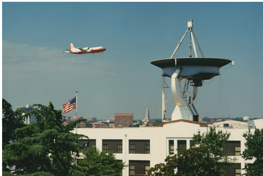
Fig. 2.7 NRL's iconic 50 foot radio telescope on the roof of the main laboratory building, visible from commercial flights into and out of nearby Reagan National Airport.

The location of the NRL dish in Washington and near National Airport meant it was subject to considerable RFI; NRL needed to find a new site for radio astronomy. In 1955, NRL obtained an 84 foot (26 meter) antenna from the D.S. Kennedy Company, patterned after Harvard's Kennedy-built 60 foot radio telescope (McClain 1958). The site for the 84 foot dish was chosen following a survey using the same equipment that had been used in 1955 to