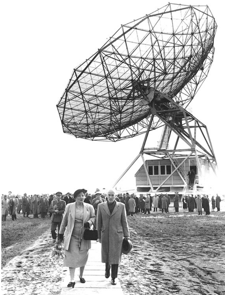
Fig. 2.8 Prof. Jan Oort and Queen Juliana leaving the 1956 dedication of the Dwingeloo 25 meter radio telescope.

locate the Green Bank site (Sect. 3.4). The chosen site at Maryland Point, Maryland, about 45 miles from the NRL Washington Lab, was found to be the quietest site within 50 miles of Washington. The Kennedy dish had a perforated aluminum surface and was effective at wavelengths as short as 10 cm.