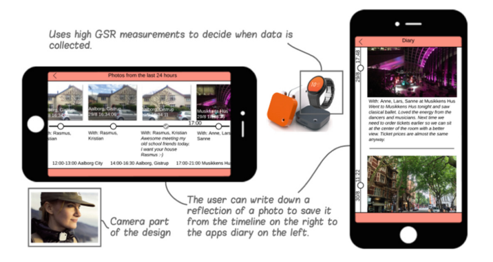
Fig. 1. Conceptual sketch of In the moment.

The conceptual provocation of our lifelogging tool relies on the philosophy of hedonism and the ideal of being present in the moment. It is about showing the world what our lives are truly about, doing what our emotions tell us to do, and not being controlled by technology to put up a façade that lives up to societal norms and expectations. We denote our tool "In the Moment" and the concept is in Fig. 1.