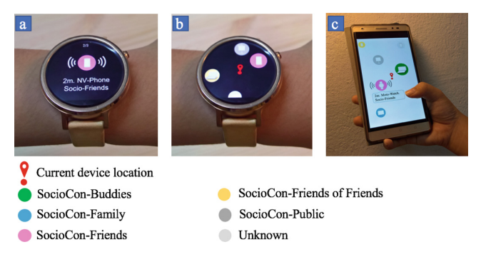
Fig. 5. Detailed view of a nearby device on the smartwatch screen (a), proximate selection map of nearby devices on the smartwatch (b) and the phone (c). This map shows each potential partnership device as a circle containing a device icon. The size of each circle is determined by the distance from the candidate to the current device. The circle color denotes its social relationship to the current device. (Color figure online)