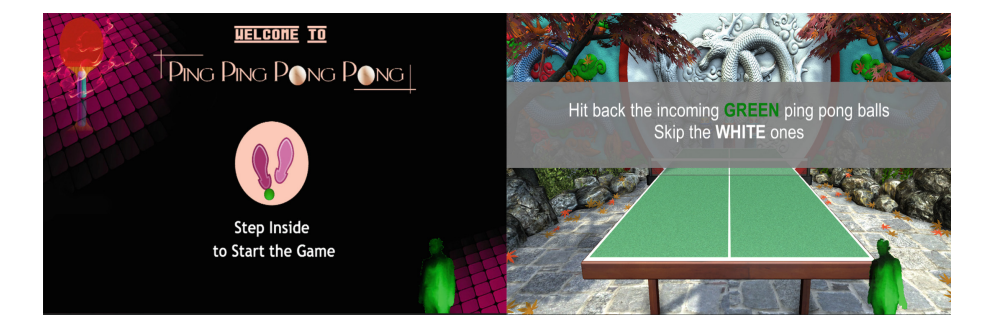
Fig. 3. Ping Pong Exergame.

To investigate whether familiarity can improve the P-E fit between older adults and exergames, we conducted a field study involving 44 Singaporean older adults. After the experiment, each participant received compensation in the form of shopping vouchers worth 20 Singapore dollars. IRB approval was obtained ahead of the experiment.