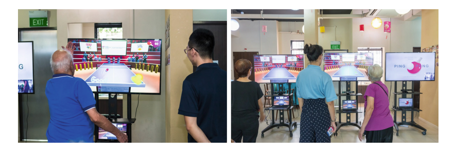
Fig. 4. Participants are playing PPE.

Participants are required to play PPE once a week in the community center for five consecutive weeks (Fig. 4). Upon the first arrival at the experiment venue, all participants filled in a consent form and a short demographic survey before the experiment start. Each participant was allocated a QR code to track their long-term performance. During the experiment, participants were required to play PPE for about 20 min each time. Throughout the whole experiment, one researcher accompanied each elderly participant in case they encounter any problem during the experiment. After completing all five game sessions, the participants filled the questionnaire to collect their opinions about PPE. Although we