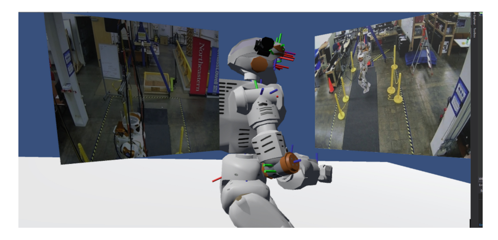
Fig. 3. Virtual world with interactable windows, both displaying different external cameras near the robot.