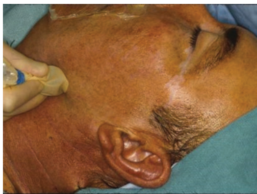
Fig. 5.2 Intraoperative use of handheld gamma probe to localize the sentinel lymph node