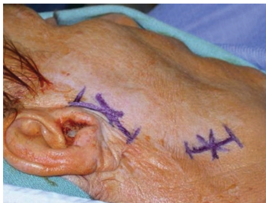
Fig. 5.3 Intraoperative surface markings after use of gamma probe