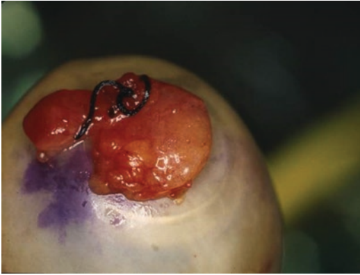
Fig. 5.4 Surgically excised lymph node