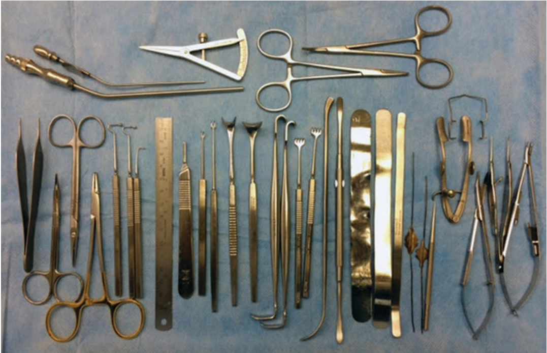
Fig. 11.1 A typical tray containing commonly used hand-held instruments for orbital tumor surgery. Rarely utilized instruments such as rongeurs, Kerrison punch, mallet, chisel, and gouge are not included. Larger surgical apparatus like reciprocating saw, rotary drill, Bovie and bipolar cauterizers, cryo instruments and tips, and dermatomes are not depicted as well