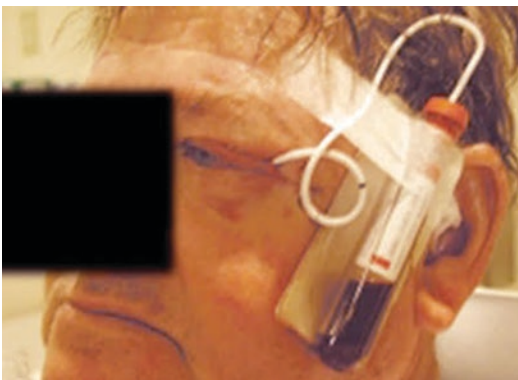
Fig. 11.6 Hemovac™ drain in position one day after surgery. (From Karcioğlu [29], with permission)

Cantholysis splits the lateral canthal tendon in parallel and allows for access to the superior and inferior crus of the tendon, it does not relieve pressure in itself. In cantholysis procedure, the orbital volume expansion is best accomplished with the lysis of the inferior crus of the lateral canthal tendon. This should include generous portions of the inferior retinaculum, essentially 90° of the orbital rim. If the pressure is not relieved, the superior crus can be cut in the same fashion. When the canthotomy is done, the lids may not cover the cornea which should be protected with ointment, collagen shield, bandage contact lens, or light patching. If the increased orbital pressure cannot be relieved, the patient should be taken back to the operating room so that the wound can be opened to evacuate the blood. If active bleeding is observed, hemostasis should be accomplished and new drains should be placed before re-closure. The addition of mannitol and acetazolamide can be considered to lower the intraocular pressure as well.