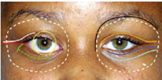
Fig. 11.2 Skin and conjunctival incisions for orbit surgery. The dotted white circle roughly corresponds to the bony margin of the orbit. Black: sub-brow incision in continuity with Lynch incision; orange: lid. Crease incision; purple: caruncular incision; red: lateral canthal incision; Blue: sub-ciliary incision; green: lateral crus incision (“swinging”), “Lid incision”; turquoise: lower lid incision; yellow: perilimbal incision; Pink: lazy-s incision within the lid crease of upper lid. (From Karcioğlu [29], with permission)

orbit with minimal external scarring. The addition of a lateral inferior cantholysis, converting to a swinging eyelid incision, can enhance access to the lateral orbit and midface. Any quadrant of the orbit can be approached through a segmental con-