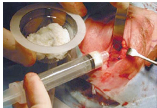
Fig. 11.4 Application of Avitene® to control oozing blood in the surgical field. (From Karcioğlu [29], with permission)

As mentioned earlier, hemostasis should be initiated by hypotensive anesthesia, as well as by injection of epinephrine-containing local