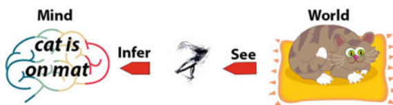
Fig. 11.1 Coordination classes allow reading out information relevant to concepts, here illustrated by “location,” from the world. The readout happens in two stages. (1) “See” or “notice” involves extracting any concept-relevant information: “The cat is above the mat,” and “The cat is touching the mat.” (2) “Infer” draws conclusions specifically about the relevant information (location) using what has been seen: “The cat is on the mat.”

Coordination classes are large and complex systems. This is structurally unlike p-prims, which are “small,” simple, and relatively independent from one another. Alignment poses a strict constraint on all possible noticings (e.g., noticing F_1 or F_2 in Fig. 11.2) and all possible inferences (e.g., I_1 and I_2 ): All paths should lead to the same determination. That is, there is a global constraint on all the pieces of a coordination class, which makes the model essentially multi-scaled . In this case, multi-scaled refers to the structure of the knowledge system—pieces and the whole system—rather than to its temporal properties, which were emphasized with J.