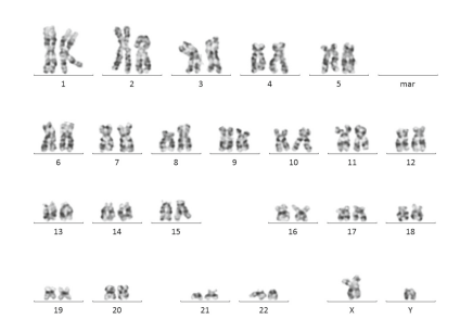
Fig. 1. An example chromosome karyotyped image.

one of the 24 chromosome classes on the basis of various differentiating characteristics like banding pattern, centromere position, and length of chromosomes. An example of a karyotyped image obtained is shown in Fig. 1.