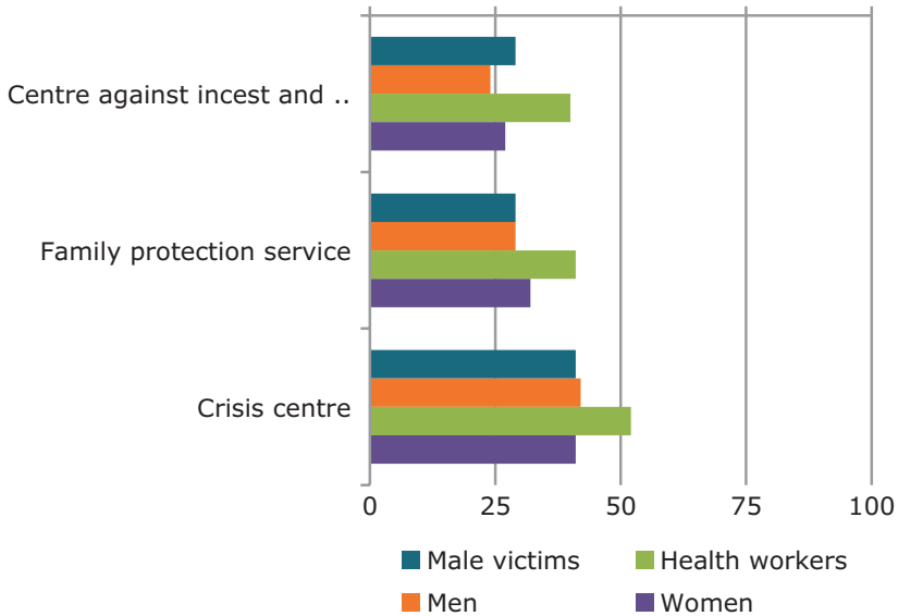
Fig. 3.2 Percentage of those aware of the services available to men subjected to violence in intimate relationships

handle it” on their own. Among those who have not sought help, over 60 per cent give this as their reason. A larger proportion of those who have been subjected to physical violence express that they would rather deal with it on their own (62 per cent) than those subjected to psychological violence (48 per cent). Many men responded that they do not generally seek help when they have problems and/or that they experience it as shameful to do so. Other respondents indicated that they feared the potential reaction of their partner or further abuse.