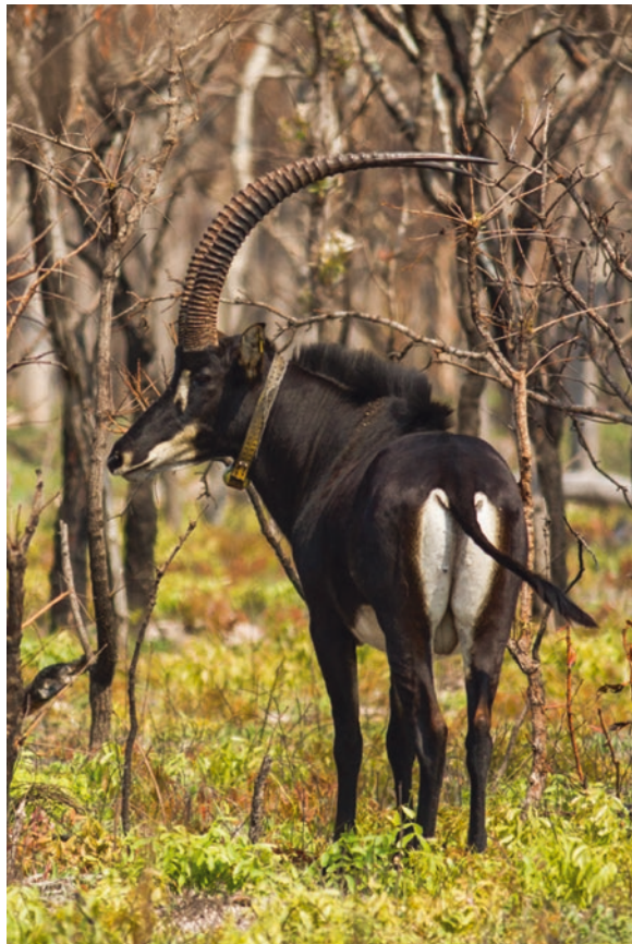
Fig. 17.1 A splendid Giant Sable Antelope bull.

Having captured the imagination of naturalists and the general public for over one hundred years, the giant sable antelope Hippotragus niger variani is the undisputed icon of Angola's natural heritage (Fig. 17.1). Its cultural significance extends from local totemic status among resident communities (where it is known as 'kolo' or 'sumbakaloko') to global recognition as an antelope symbol and flagship for conservation. Soon after its discovery, the giant sable was elevated to a high pedestal among the hunting community as one of the most sought after trophy prizes, and fuelled the lust of big game hunters from all over the world. In Angola, the giant sable was the first animal to receive full legal protection and was soon embraced as an icon during colonial rule. Since Angola's independence in 1975, its status has been reinforced. The importance of the current unanimous recognition of the giant sable as a national symbol should not be underestimated, constituting a key factor uniting Angola's people regardless of their different ethnic groups, religious beliefs or political ideologies, and thus contributing to social cohesion and national pride.