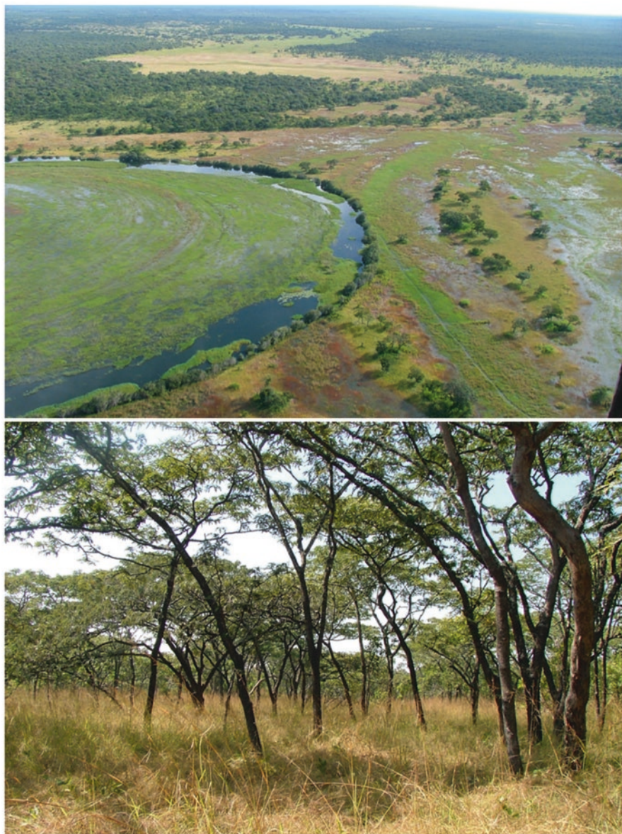
Fig. 17.4 Aerial view of the preferred habitat of the Giant Sable Antelope: a mosaic of grassland and miombo woodland – the latter pictured in the bottom photograph.

In common with most other social antelopes, giant sable are gregarious and are structured according to three social classes: the breeding or nursery herds, bachelor groups, and territorial bulls (Estes and Estes 1974 ; Estes 2013 ). The matriarchal herd, composed of breeding cows, calves and young, constitute the main unit (Estes