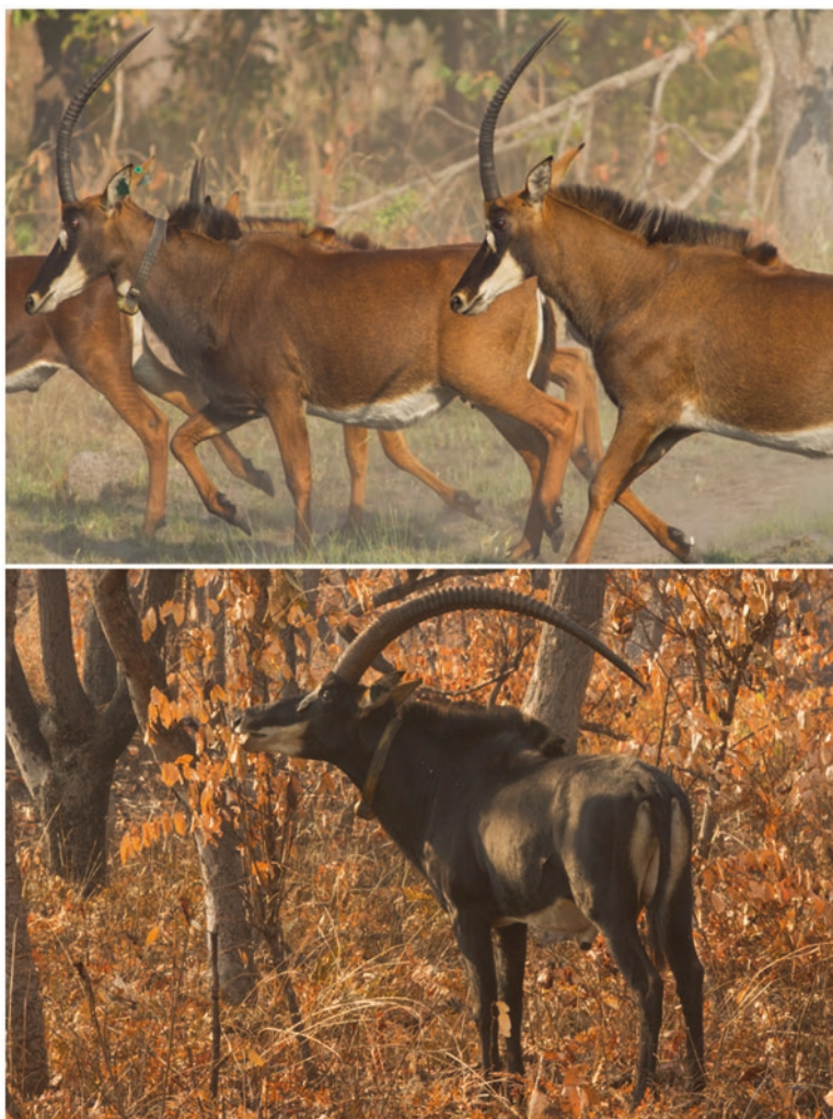
Fig. 17.2 Sexual dimorphism in antelopes is unique to the Sable Antelope but particularly pronounced in the more sedentary Giant Sable of Angola, where mature bulls are jet black (bottom) and cows have a rich cinnamon pelage.

1999; Pitra et al. 2006). The results, in combination with the fact that sable collected in western Zambia often present similar facial markings, were further interpreted as blurring the differences between giant and western Zambian sable antelope (Wessels 2007). However, clear genetic differences exist between these western Zambian sable and giant sable, confirming that the giant sable represents a distinct mitochondrial evolutionary lineage (Jansen van Vuuren et al. 2010).