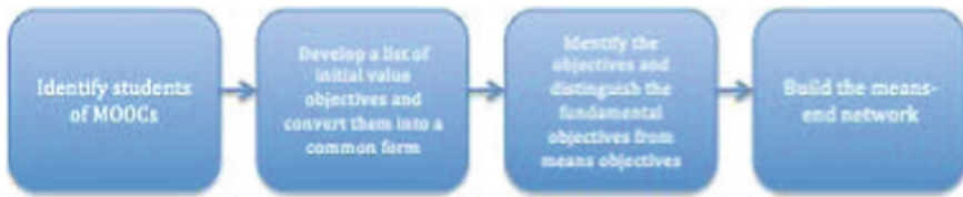
Fig. 1. Steps of VFT approach

In this study, we employed VFT approach as follows (see Fig. 1):