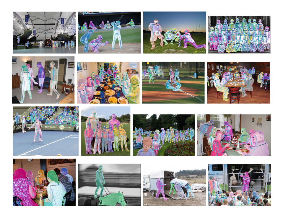
Fig. 5. Visualization on COCO val images. The last row shows some failure cases: missed key point detection, false positive key point detection, and missed segmentation.

In Fig. 5 we show representative person pose and instance segmentation results on COCO val images produced by our model with single-scale inference.