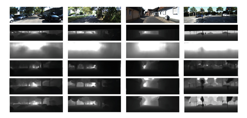
Fig. 3. Qualitative results on the test set of the KITTI Raw dataset used by Eigen et al. [7]. From top to bottom, the images are input, ground truth, results of Eigen et al. [7], results of Garg et al. [9], results of Godard et al. [12] and results of our method, respectively. Sparse ground truth have been interpolated for better visualization.

Supervisory Signal: To validate the effectiveness of using predicted dense depth maps as ground truth at training time. We compare our baseline model (denoted as Baseline<sup>‡</sup>) with a variant (denoted as Baseline<sup>†</sup>) which is trained using image alignment loss. Results are shown in the first two rows of Table 2. It can be easily observed that Baseline<sup>‡</sup> achieves better results than Baseline<sup>†</sup> on all the metrics. This may due to the well known fact that stereo depth reconstruction based on image matching is an ill-pose problem. Training on a image alignment loss may provide inaccurate supervisory signal. On the contrary, the dense depth maps used in our method are more accurate and more robust against the ambiguity, since they are produced by a powerful stereo matching model [22] which is well designed and trained on massive data for the task of depth reconstruction. Thus, the superior result, together with the above analysis, well validate that utilizing predicted depth maps as ground truth can provide more useful supervisory signal.