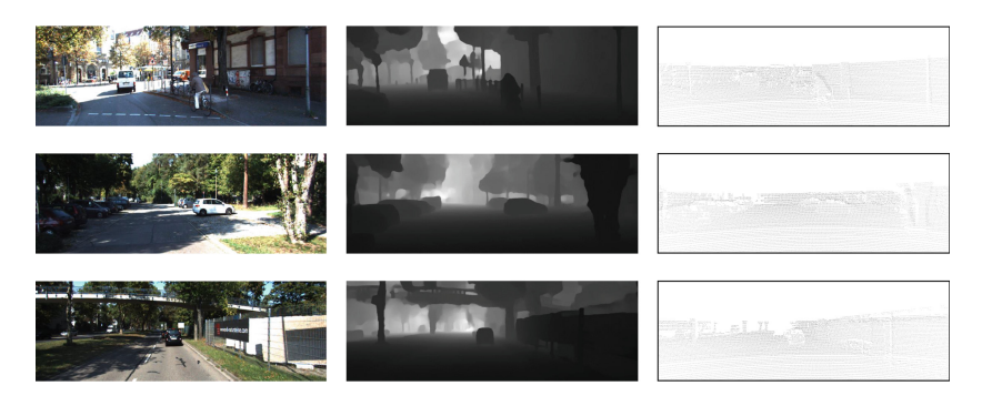
Fig. 2. Examples of the enhanced dense depth maps generated by a stereo matching model [22]. We use these depth maps as complementary data to the sparse ground truth depth maps. The left column contains RGB images, while the middle and right column show the enhanced depth maps and sparse ground truth, respectively.

indicates the global layout and properties of the image. The global features of the fully-connected layer, the absolute features from the deep encoder, and the relative features are fed into our depth estimator, a multi-layer CNN, to generate an initial coarse estimate of the image depth. In the meanwhile, we also take these features as initial input of the following multi-scale refinement modules. The refinement network at each scale is composed of a proposed vertical pooling layer which aggregates local depth information vertically, and a residual estimator which learns residual map for refining the coarse depth estimation from the last scale. Both the features from previous scale and the proposed vertical pooling layer are used in the residual estimator.