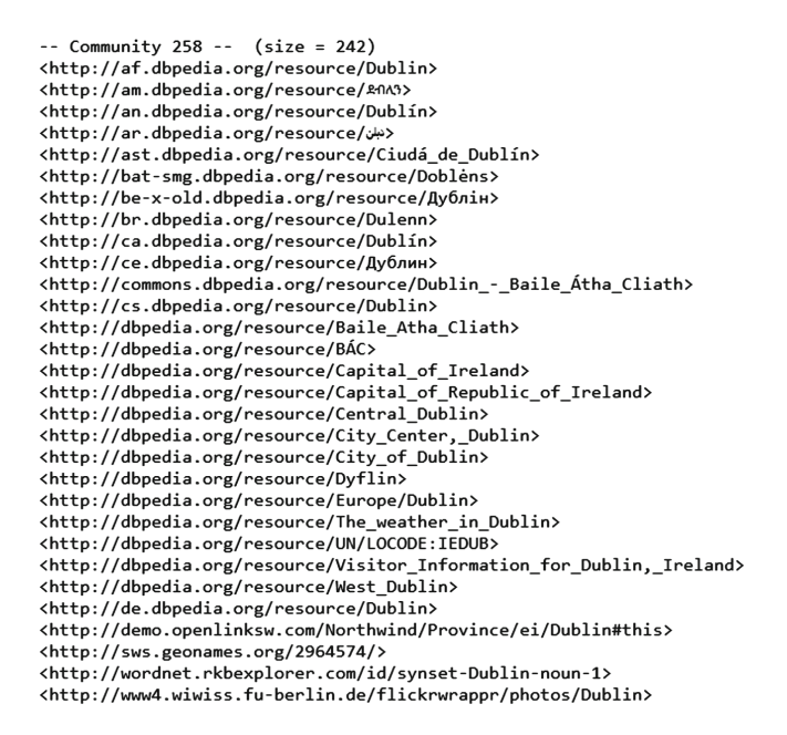
Fig. 2. Excerpt of the 242 terms included in the community containing the IRI http://dbpedia.org/resource/dublin

encoded in IRI names significantly coincides with the formal meaning of IRIdenoted resources. Hence, indicating that IRIs can give an idea on the quality of the detected communities.