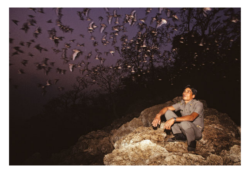
Fig. 18.9 Game warden hired to protect the bats of Khao Chang Pran Cave, in Thailand, watches millions of wrinkle-lipped bats ( Tadarida plicata ) emerge