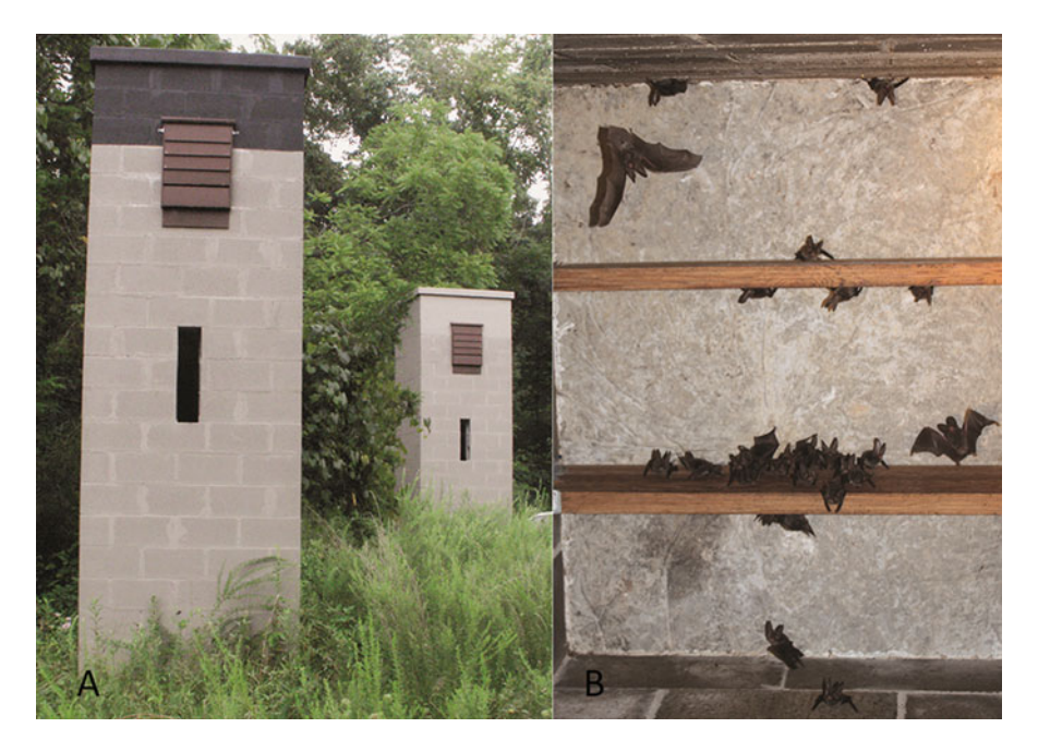
Fig. 18.13 (a) Tower roosts, built to provide alternative homes for Rafinesque's big-eared bats ( Corynorhinus rafinesquii ) that have lost their original homes in extra large tree hollows at Mammoth Caves National Park, KY. (b) A maternity colony of the same species using an artificial roost in Trinity National River Wildlife Refuge, TX

Due to its popularity with bat watchers, a new roost that can accommodate 400,000 was built in 2010. The combined colony size is already 300,000 and growing rapidly (Reed 2012). More free-tailed bats now live in these two artificial roosts than are known from all the natural roosts in Florida combined, illustrating that loss of roosts is the key bottleneck to restoring bat populations of that area.