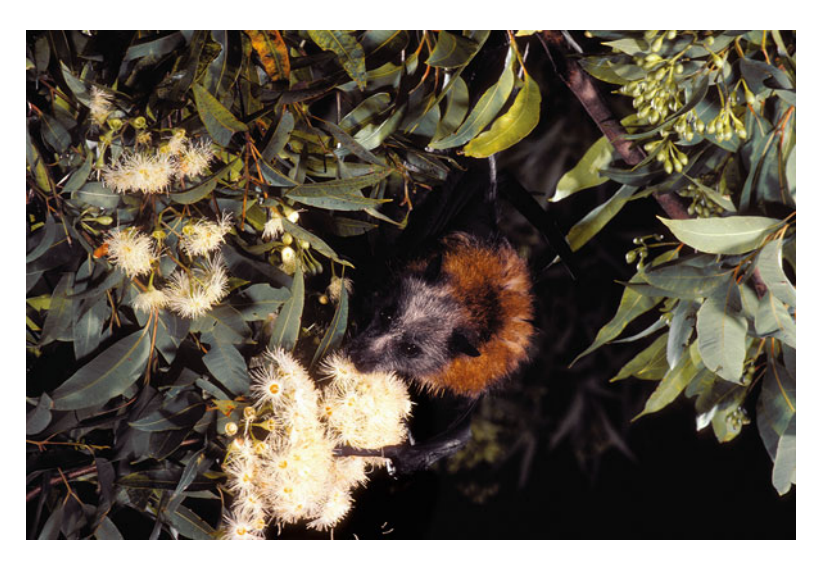
Fig. 18.3 Flying foxes are primary pollinators for many of Australia's most ecologically and economically important trees. This gray-headed flying fox ( Pteropus poliocephalus ) is pollinating a broad leaf apple tree ( Angophora subvalutina )