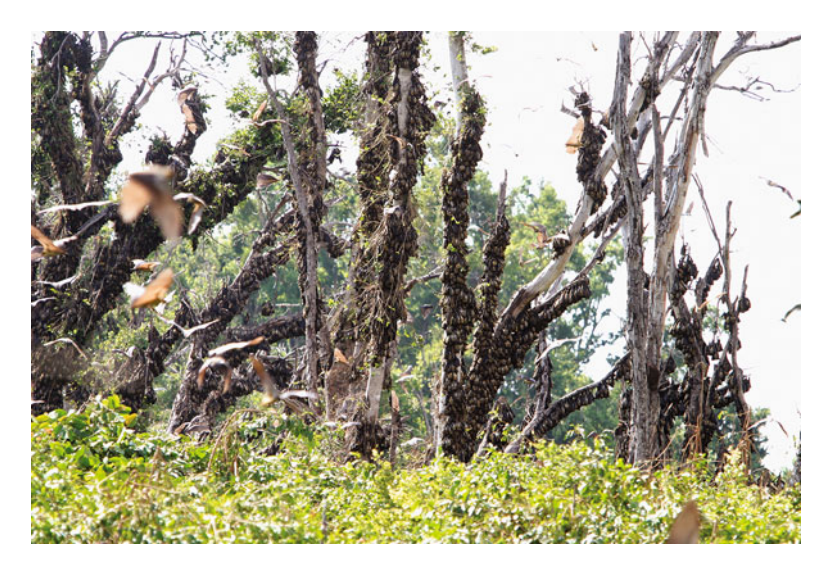
Fig. 18.2 Part of a massive colony of straw-colored flying foxes ( Eidolon helvum ) at Kasanka National Park in Zambia that consumes an estimated 6,000 tons of fruit and nectar per night. Their impact on seed dispersal and pollination is enormous, covering a huge area of equatorial Africa during annual migrations

During the 1994 human Ebola outbreak in northeastern Gabon, gorillas, monkeys, and bush pigs were dying and being scavenged for human food. That miners contracted Ebola was assumed due to associating with bats in the mines even though the outbreaks seemed most closely associated with humans scavenging bushmeat (Lahm et al. 2007). In only one instance has bat hunting appeared to be associated with a human case despite the fact that large numbers of straw-colored fruit bats ( Eidolon helvum ) are sold for human food (Leroy et al. 2009). Regardless of whether or not bats are reservoirs for Ebola, direct transmission from them to humans or livestock is exceedingly rare, if it occurs at all (Fig. 18.2).