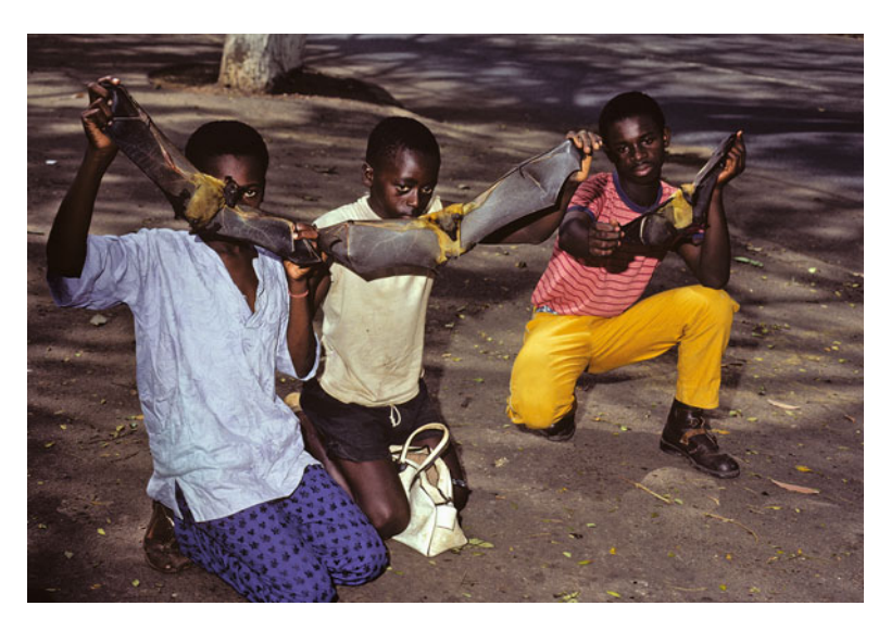
Fig. 18.4 These young bat hunters earn a living shooting straw-colored flying foxes ( Eidolon helvum ) with sling shots in a city park in Abidjan, Ivory Coast, where bat-eating is very popular

decades as a result of overhunting, some being driven to extinction up to 100 years ago (Pierson and Rainey 1992; Racey and Entwistle 2003), it is unlikely that humans are at greater risk today than in the past. Surprisingly, not even guano mining in major, occupied bat caves has been identified as a source of human illness. Clearly, bats have a remarkable safety record.