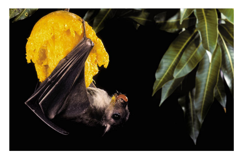
Fig. 18.11 An Egyptian fruit bat ( Rousettus aegyptiacus ) eating a ripe mango, missed during harvest. Removal of such fruits aids growers in reducing harmful fruit flies and fungi

When growers and government officials lack knowledge, serious harm can be inflicted. In 1958, Israeli government officials began fumigating caves used by Rousettus aegyptiacus using ethylene dibromide and later lindane, in response to fruit grower complaints. Entire cave ecosystems were lost as were approximately 90 % of insect-eating species followed by population explosion of noctuid moths that caused major crop damage (Makin and Mendelssohn 1985). Massive eradications were also carried out in Cyprus (Hadjisterkotis 2006). Unfortunately, fruit bats are still classified as vermin (Singaravelan et al. 2009) even in countries like Australia where much progress has been made. The New South Wales Farmers Association recently called for a government cull of endangered flying foxes (Cox 2011). Objective documentation and education continues to be of paramount importance in dealing with fruit damage.