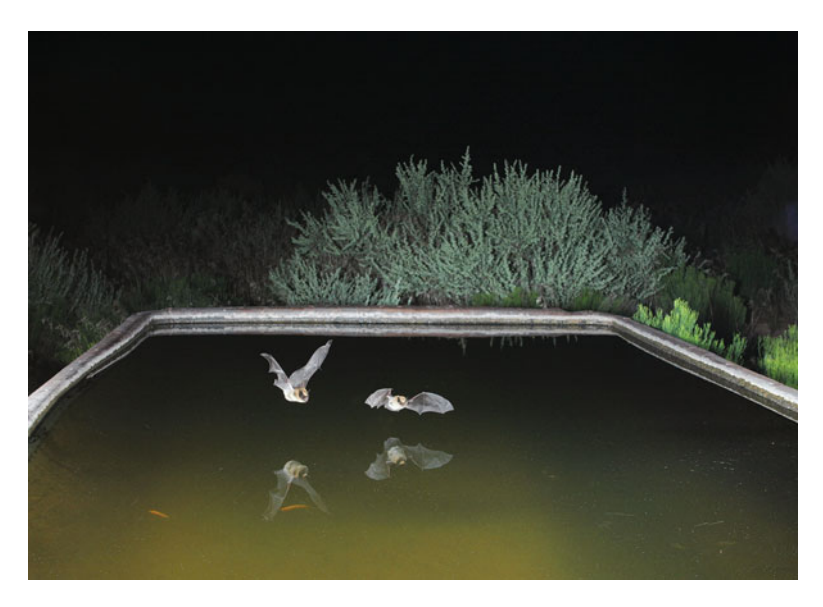
Fig. 18.14 California myotis ( Myotis californicus ) drinking at livestock watering trough in arid southwestern US. On hot nights, bats often visited at rates approaching one per second

rapidly growing popularity of bat watching, gives hope for the future. Much remains to be accomplished in educating the public to support such efforts, but growing numbers of nature centers and commercial tour cave owners are now protecting bats because it is simply good business.