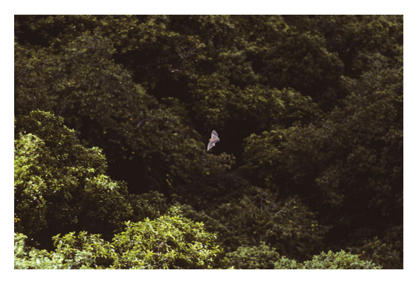
Fig. 18.6 Samoan flying fox (Pteropus samoensis) riding mid-day thermals above rain forest

Where private land owners control access to bat caves, simple education that allays fear and promotes understanding of bat values can be highly effective. Working with owners of caves occupied by endangered gray bats ( Myotis grises-cens ), I will never forget one who asked me to kill all the bats. I picked up a handful of potato beetle wings the bats had discarded beneath their roost and, on exiting, asked if he knew what kind of insect they were from. I had noticed he was growing potatoes and corn nearby. Of course, he recognized some of his worst crop pests and was surprised that bats ate them. When he asked how many insects his colony ate, I estimated about 100 lb nightly but pointed out that they didn't just eat potato beetles. They likely also consumed corn-ear worm moths and mosquitoes. From then on, he was an ardent bat protector!