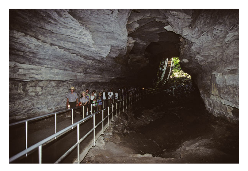
Fig. 18.12 Tour group entering Mammoth Cave in Mammoth Cave National Park. Millions of bats, dominated by the now endangered Indiana bat ( Myotis sodalis ), relied on this huge and diverse cave for winter hibernation prior to its early commercialization

made for commercial tourism. By the time Mammoth Cave National Park was founded in1941, the bats were gone (Toomey et al. 2002).