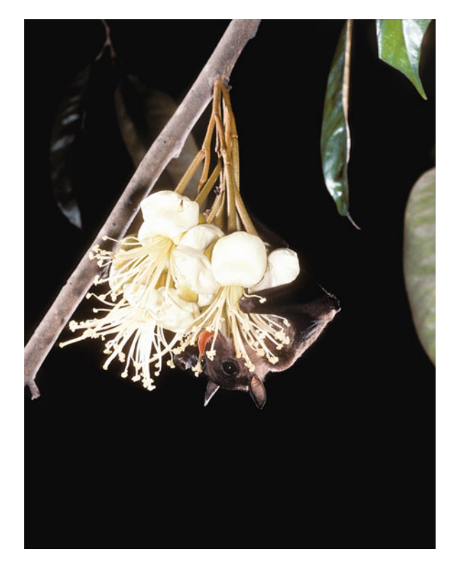
Fig. 18.10 A dawn bat ( Eonycteris spelea ) pollinating durian ( Durio zibethinus ). Several pteropodid bat species are the exclusive pollinators of this king of Southeast Asian fruits

Even after I convinced them that bats are essential pollinators, some still insisted that they must be harming their crops by sometimes knocking off whole flowers. At that, I point out that the weight of too many large fruits could break branches and that by preventing some fruit development, those remaining have improved quality.