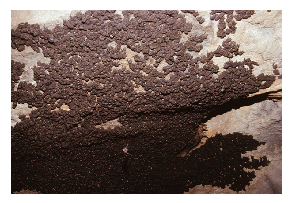
Fig. 18.1 Hibernating gray bats ( Myotis grisescens ) in Hubbards Cave, Tennessee. Protective gates have enabled this once nearly extirpated population to rebuild to more than 500,000

In May 1976, the US Centers for Disease Control and Prevention (CDC) began officially issuing DDT for poisoning bats in buildings that not only needlessly harmed bats but created far greater public health risks than the bats themselves (Barclay et al. 1980; Brass 1994; Kunz et al. 1977; Trimarchi 1978). Denny Constantine, the leading authority on bat rabies, condemned the nationwide drive to create hysteria and the resulting use of exceptionally dangerous chemicals to kill bats. He concluded that "The public health problems posed by bats are relatively insignificant compared to the public health problems usually initiated by those who publicize bats as problematic, typically resulting in an exaggerated, inappropriate response, damaging to the public health" (Tuttle 1988a).