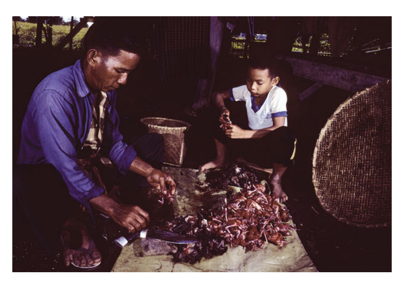
Fig. 18.8 Thai bat hunters preparing a night's catch of fruit bats ( Rousettus and Eonycteris ) for sale to local restaurants. Throughout the Old World tropics hundreds of thousands of pteropodid bats are caught and sold for human consumption annually without apparent harm to hunters or consumers, though many bat populations have been decimated