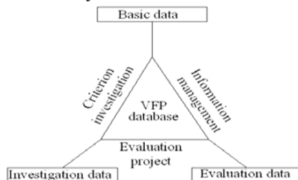
Fig.1: Integrative overall of the system

This system development used the pattern of Visual FoxPro, and the overall system used the medium and small scale database management system of Visual FoxPro for storing data. The platform of the system development was the programming language provided by VFP. Fig.1 was the integrative overall of the system.